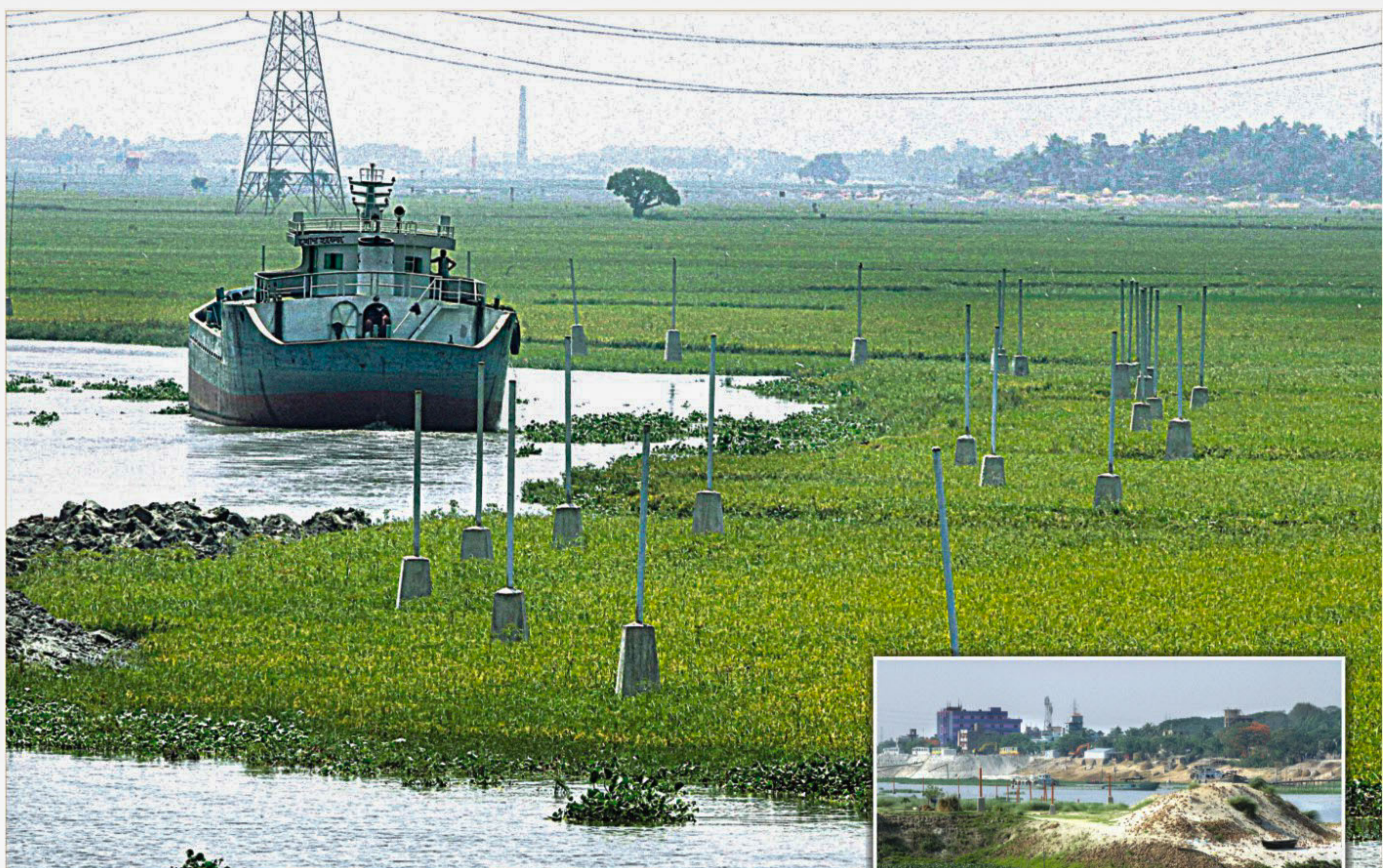
The authorities have demarcated the Buriganga in Birulia and Sinnirtek, inset, in Dhaka excluding the foreshore of the river. The act ignores a government committee suggestion for a fresh survey of the foreshores and violates a High Court order to maintain the natural course of the river.