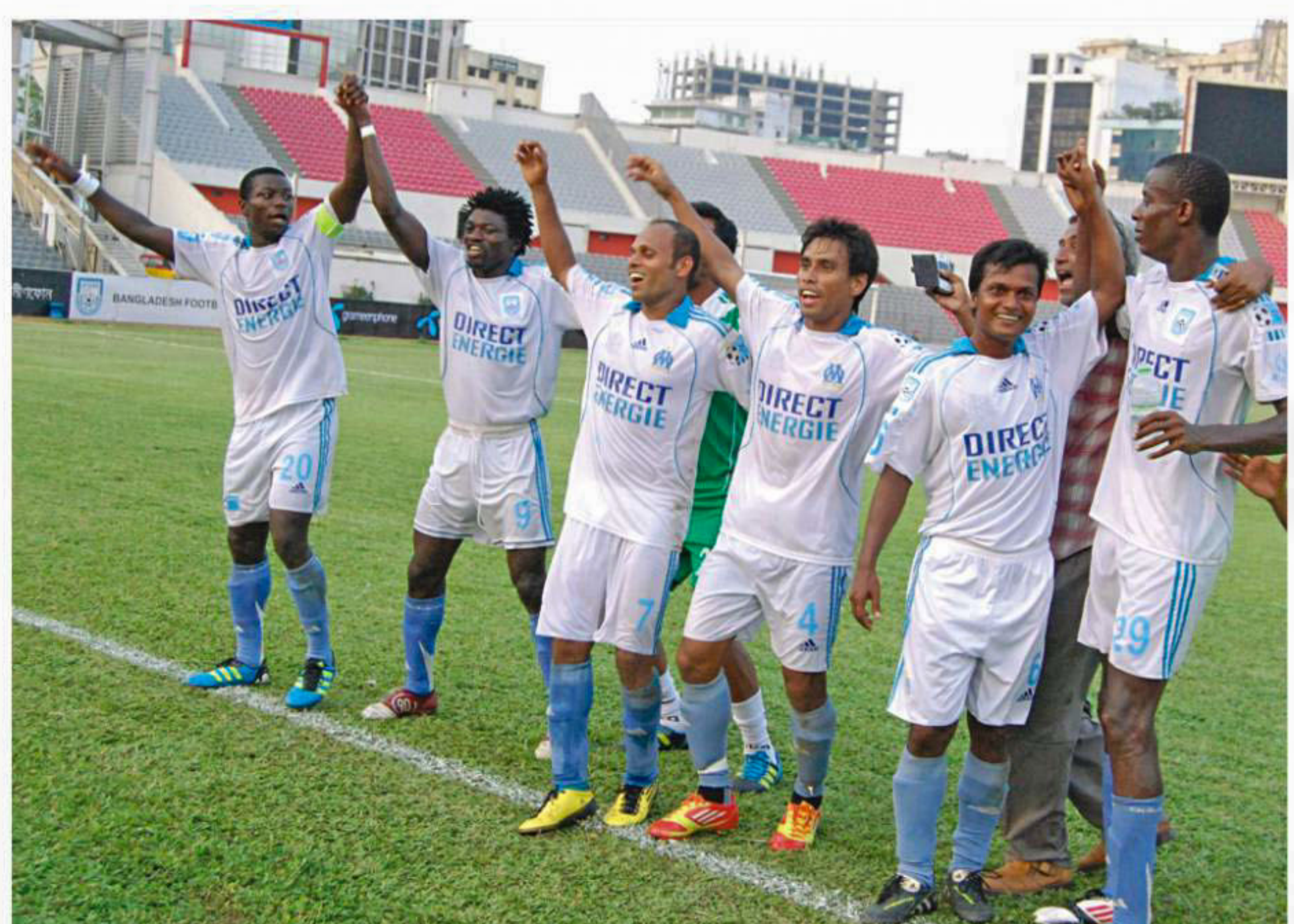
Farashganj SC players join in a victory parade after their win against Muktijoddha Sangsad at the Bangabandhu National Stadium yesterday.