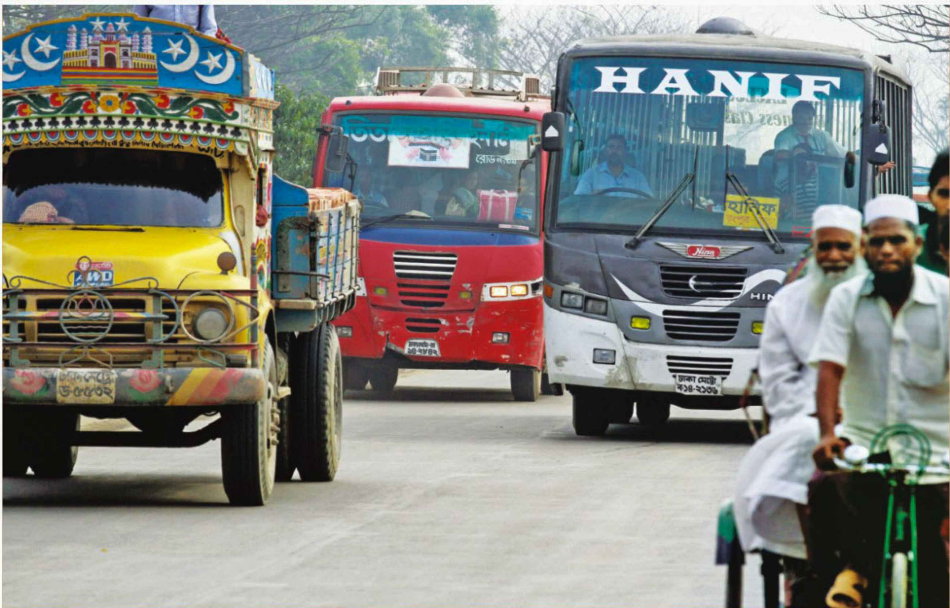
A bus and a truck pull out to overtake another bus on Dhaka-Aricha highway at Hemayetpur on the outskirts of Dhaka city yesterday. Reckless overtaking on highways leads to frequent accidents.