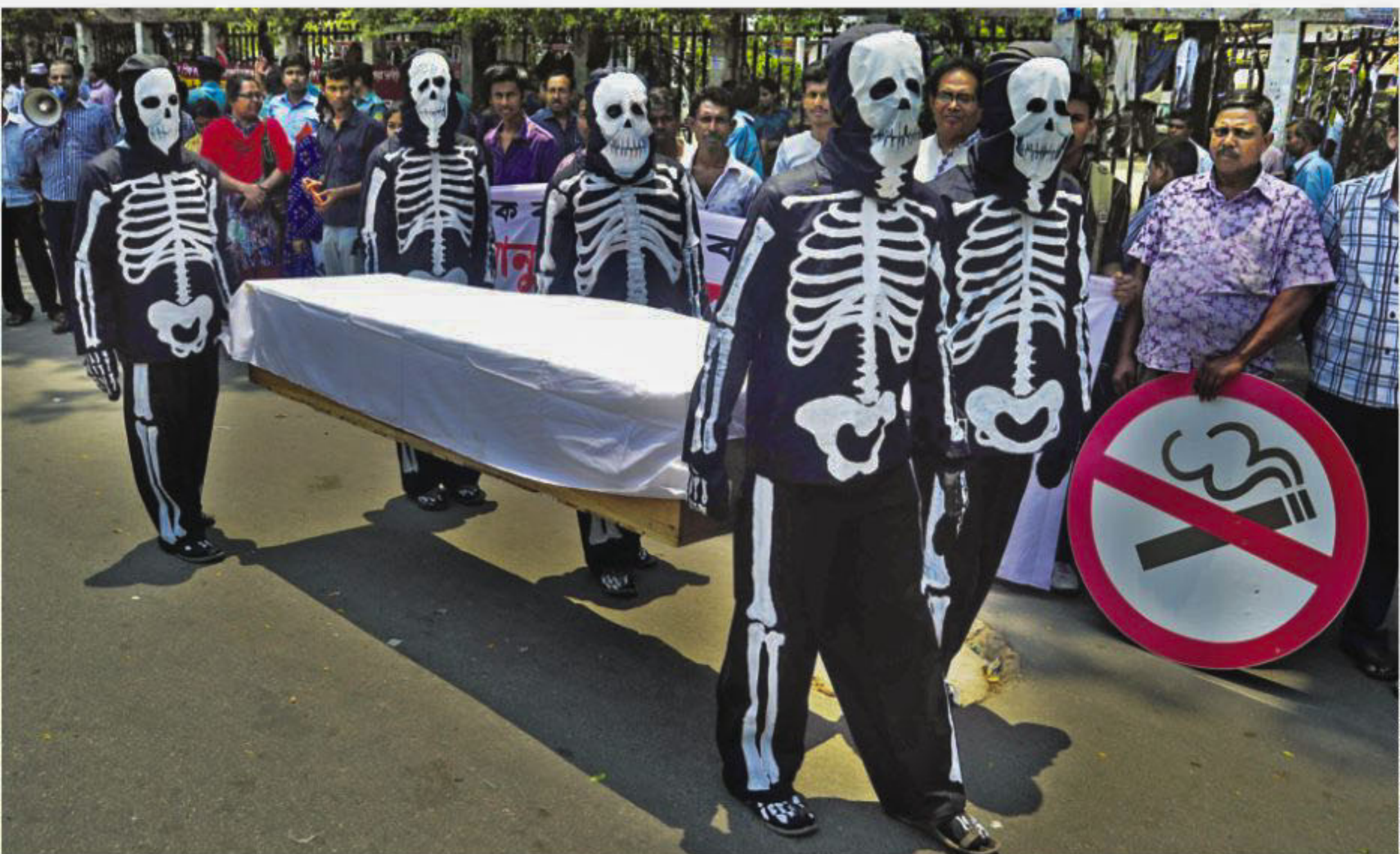
Anti-tobacco campaigners bring out an innovative procession in front of the Jatiya Press Club in the capital yesterday morning where five skeletons carry a coffin. During a rally held there, speakers asked the government to curb tobacco use, plug the loopholes in the tobacco consumption law and impose high tax on tobacco products.