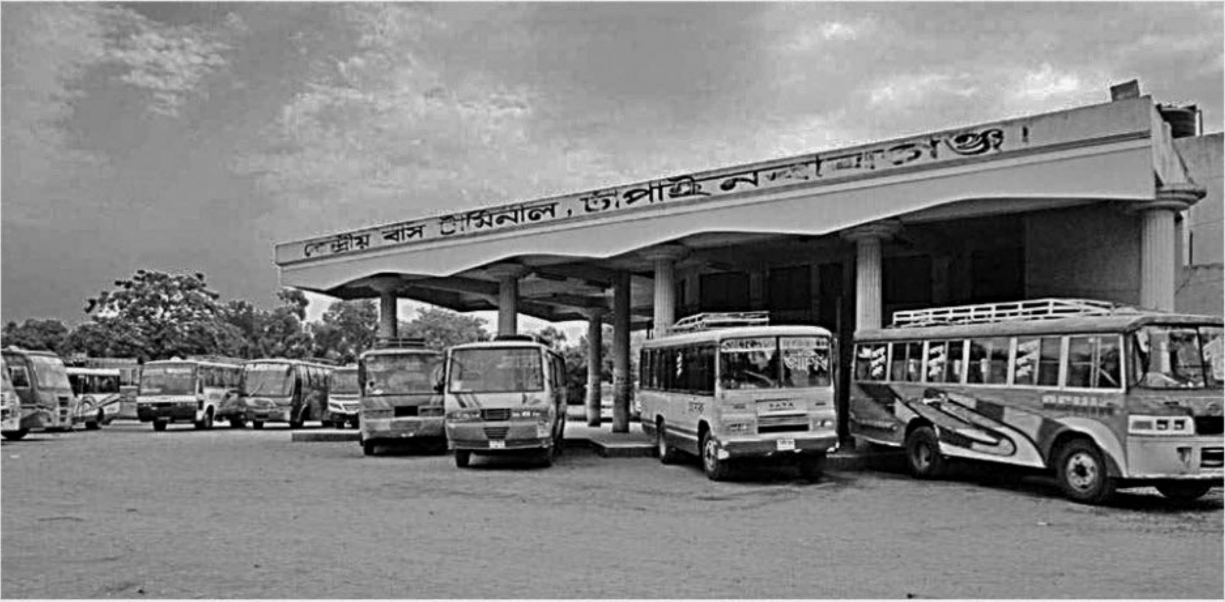
Buses lie idle at Chapainawabganj central bus terminal as Truck and Motor Sramik Union enforces a 72-hour transport strike in the district from yesterday morning protesting illegal toll collection by a section of people in the transport sector in the name a workers union.