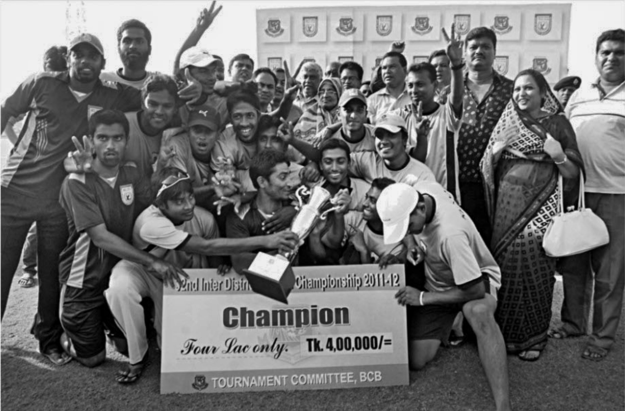
Players of the victorious Khulna side pose for a photograph with the 32nd inter-district cricket championship trophy at the Sheikh Abu Naser Stadium in Khulna on Saturday.