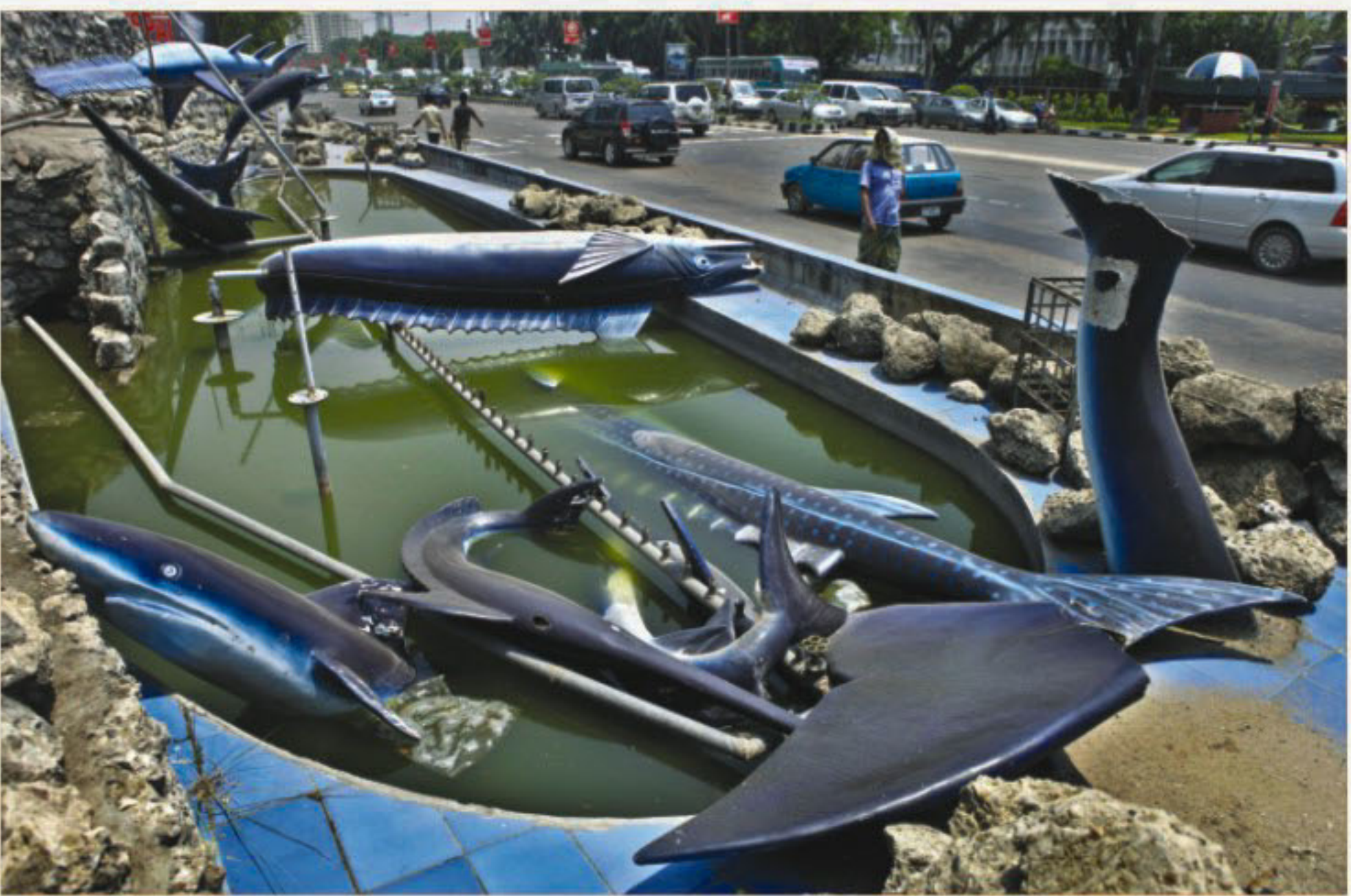
The broken pieces of a sculpture on marine life, built opposite to the Navy Headquarters in Banani as part of beautification during World Cup Cricket 2011, lies unattended for the last 25 days after unidentified miscreants carried out this senseless vandalism under the cover of night. The photo was taken yesterday.

Sayedee and Salaududdin Quader are two among six Jamaat-e-Islami and two BNP leaders who are facing such charges at two tribunals set up to deal with the 1971 crimes.