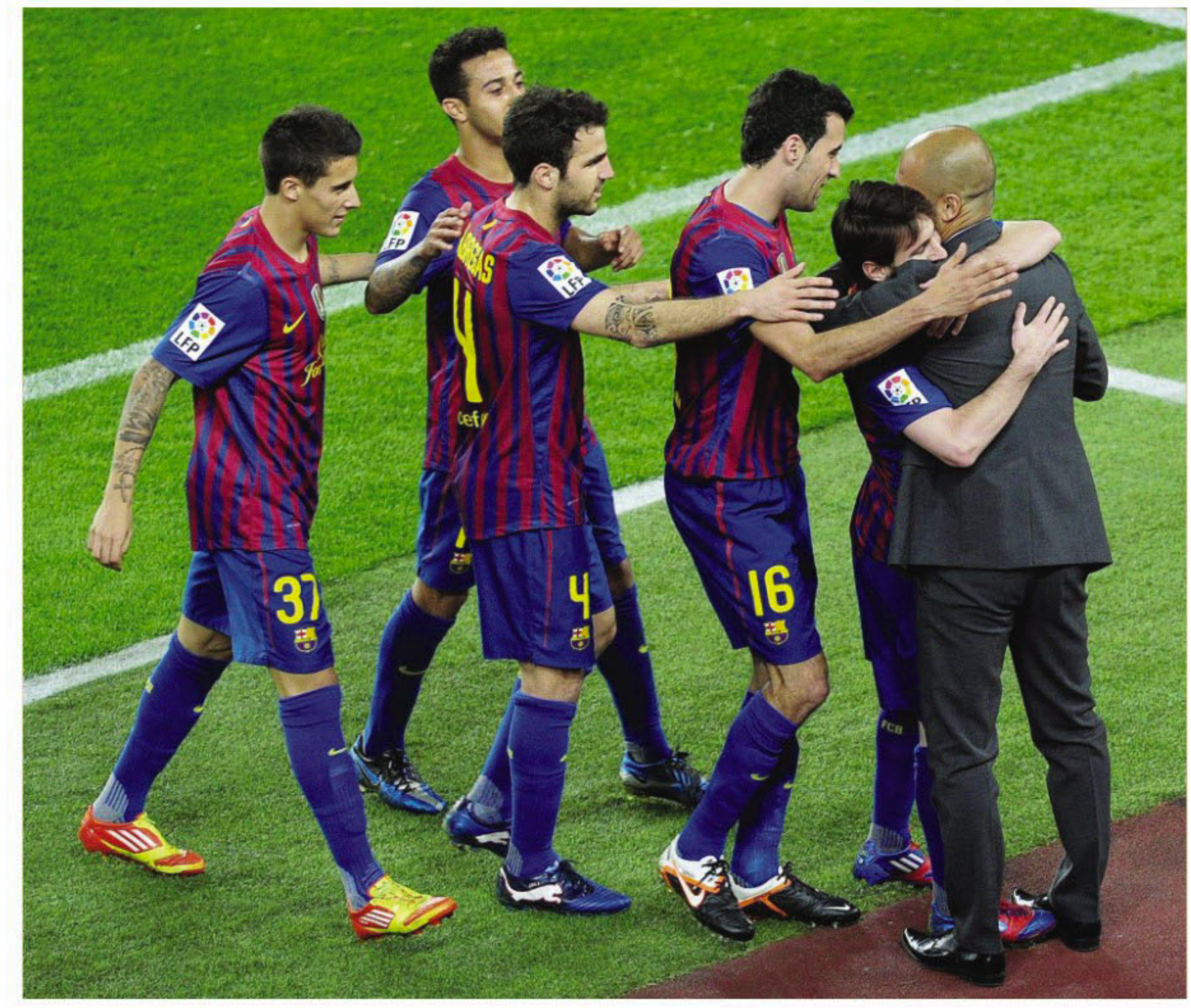
Lionel Messi (2nd from R) hugs coach Pep Guardiola as a troupe of La Masia graduates (from R-L) Sergio Busquets, Cesc Fabregas and Tiago follow suit during their derby against Espanyol at the Camp Nou on Saturday. The game marked Guardiola's last home game in his tenure as Barcelona coach.