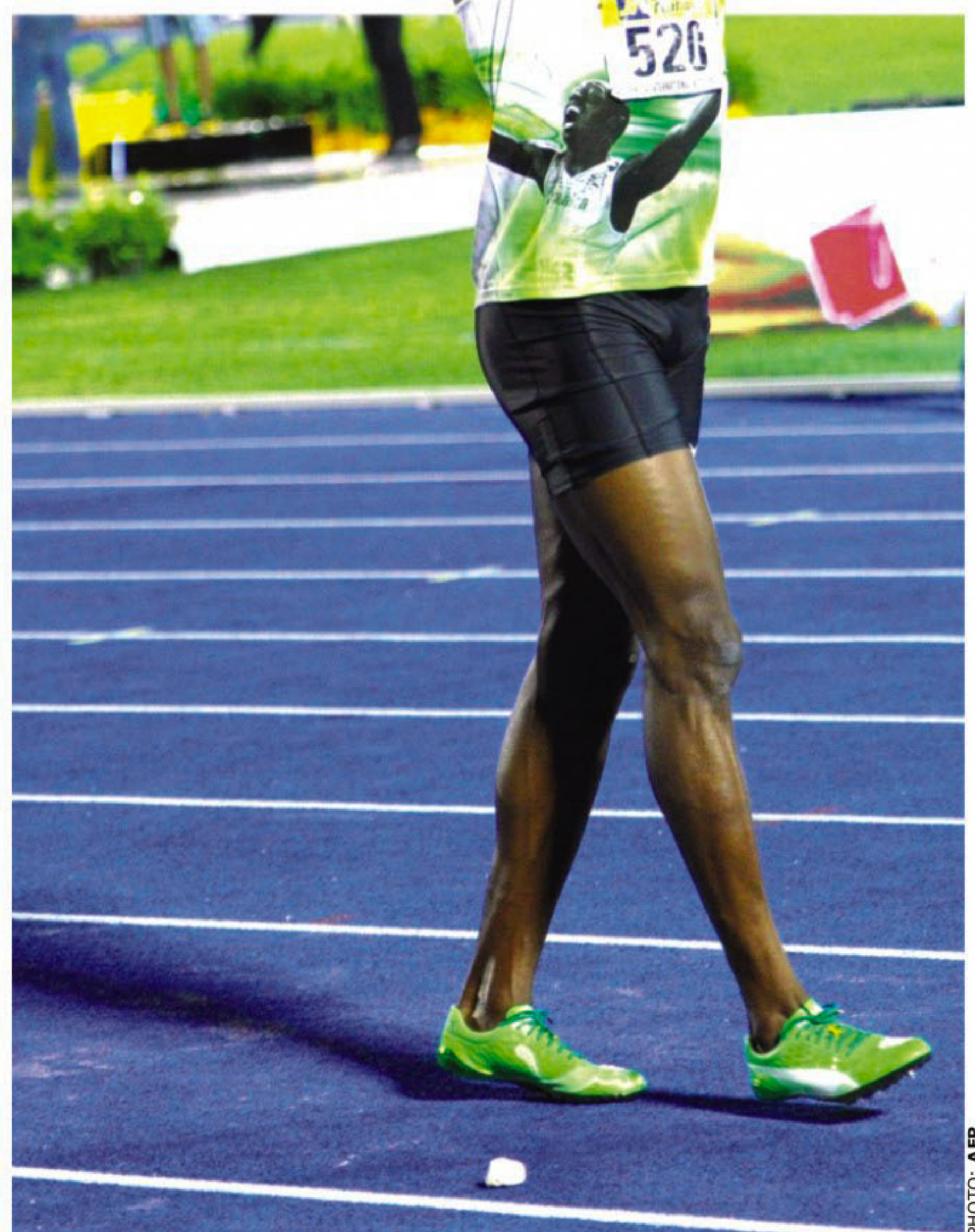
Jamaica's superstar sprinter Usain Bolt acknowledges the crowd's applause after recording a world leading 9.82 seconds to win the men's 100-metre at the Jamaica International Invitational at the National Stadium in Kingston on Saturday.