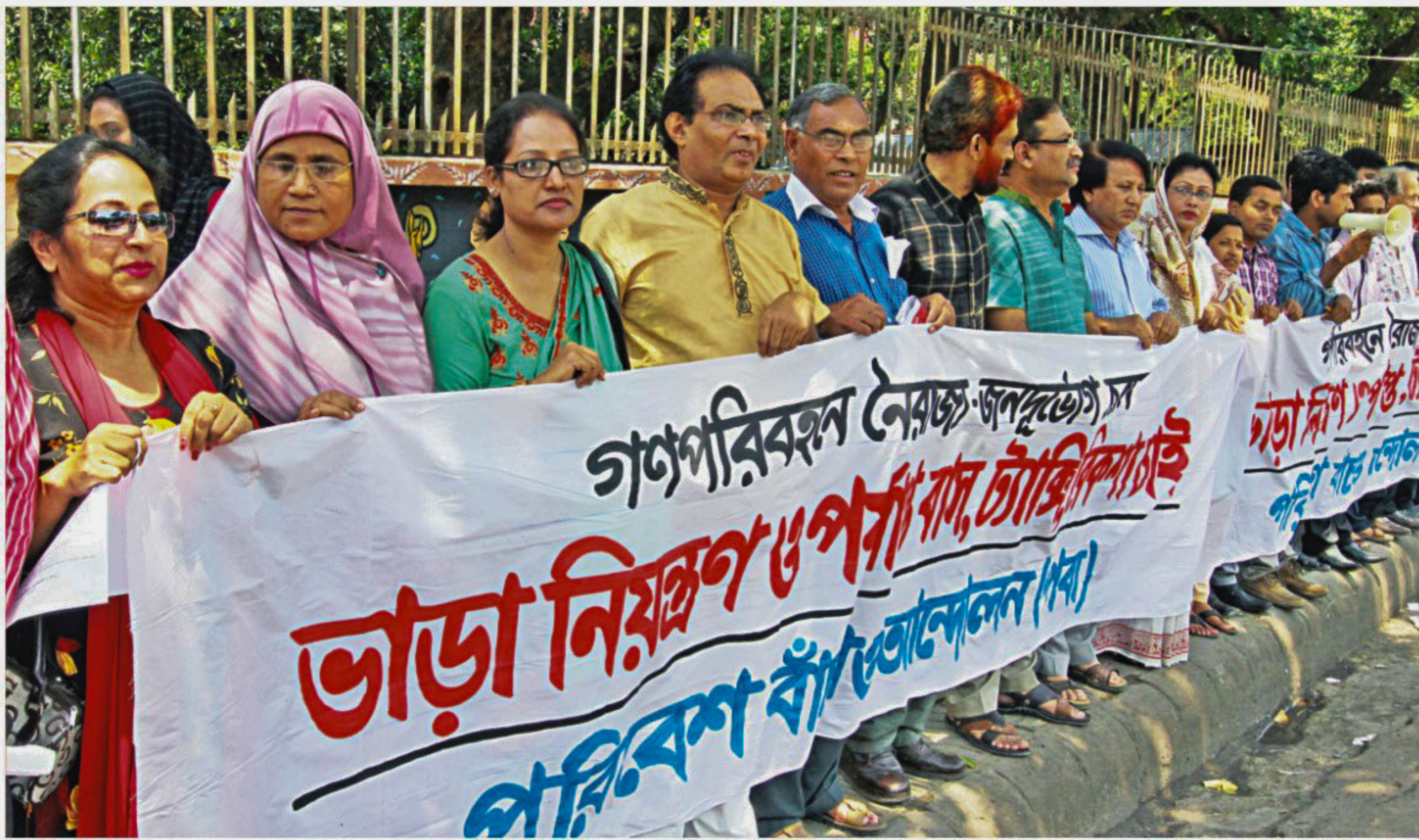
Poribesh Bachao Andolon forms a human chain in front of Faculty of Fine Arts of Dhaka University yesterday demanding sufficient number of buses, taxis and rickshaws and control over transport fares.