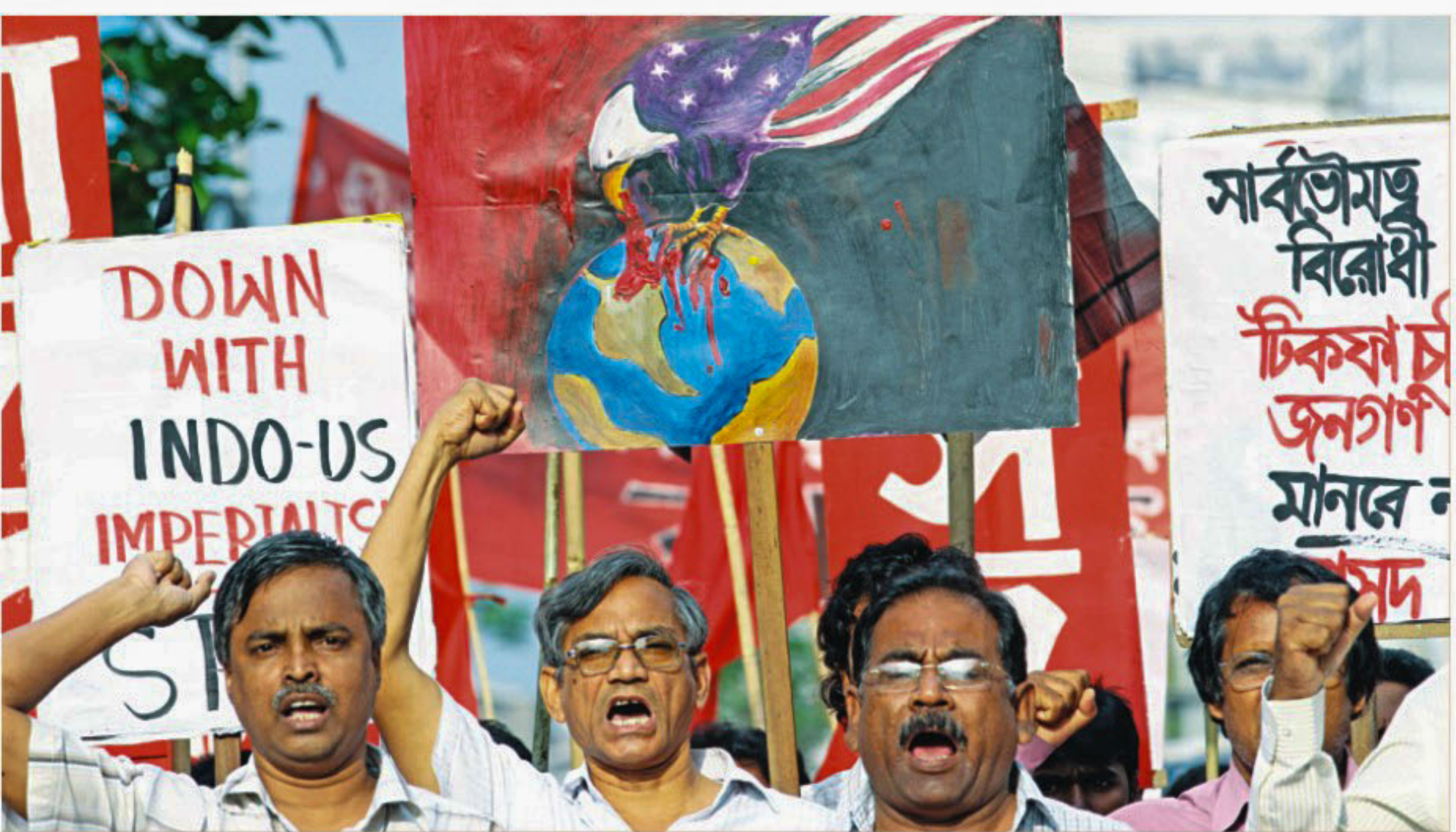
Agitators shout anti-US slogans during a procession brought out by left-leaning activists in the capital yesterday in protest of the visit of US Secretary of State Hillary Clinton, who arrives in Dhaka today.