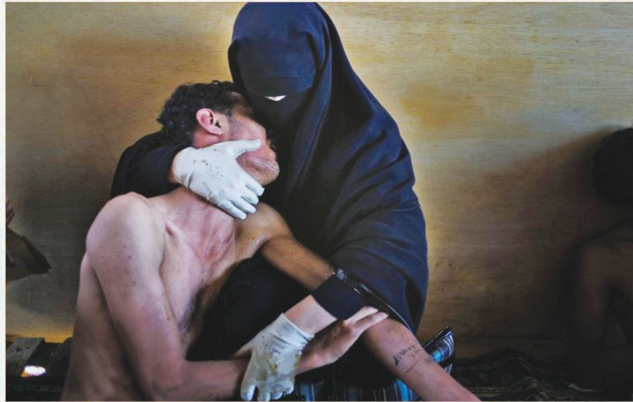
Some photos are really arresting while some are revolting and unsuited for public display.