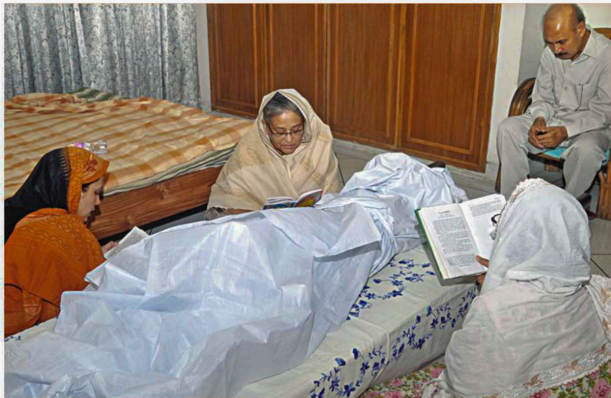
Prime Minister Sheikh Hasina recites from the Holy Quran beside the corpse of her paternal aunt Khadiza Hossain at the deceased's Dhanmondi residence in the capital yesterday.

Police later sent the bodies to Noakhali Medical College Hospital for autopsies.