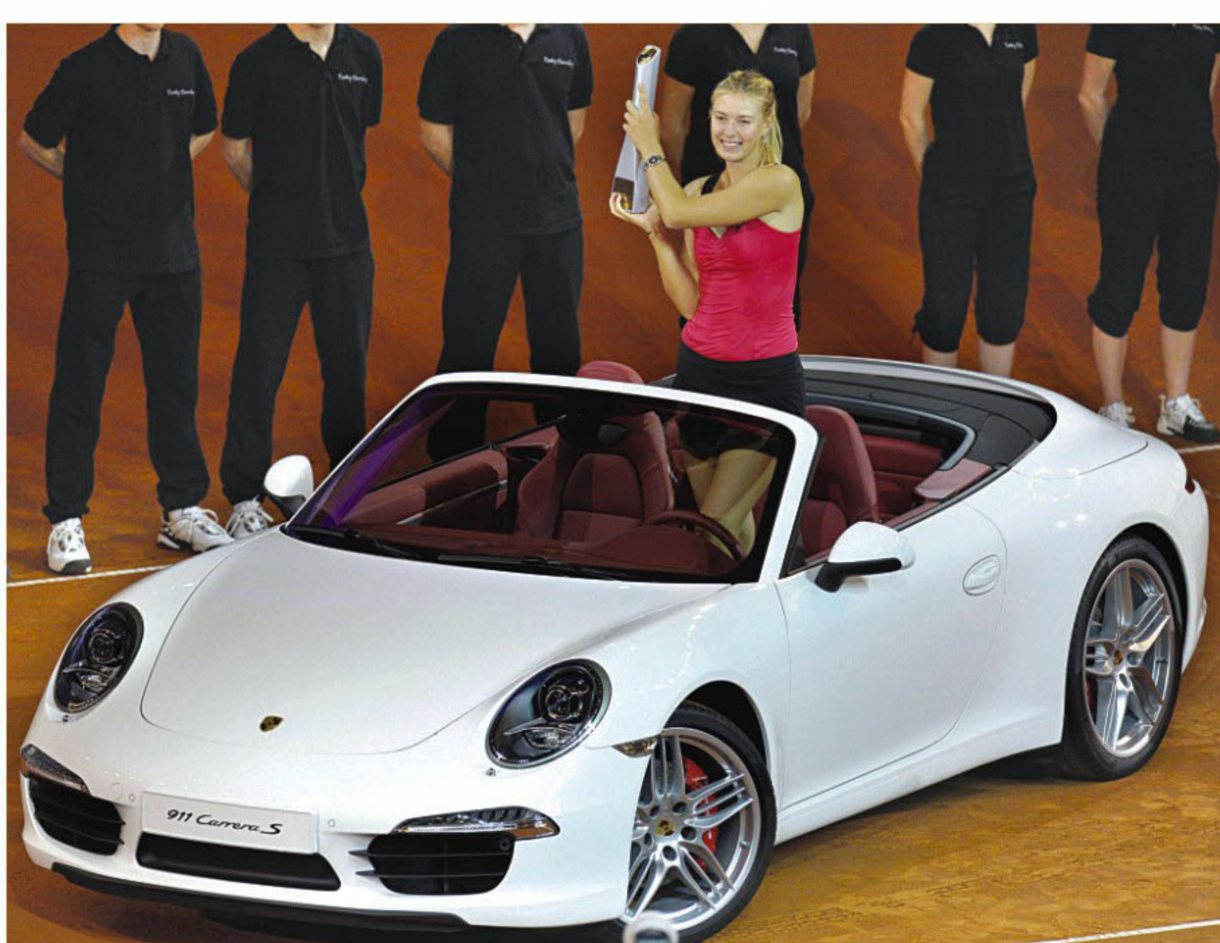
Russian tennis world No 2 Maria Sharapova poses for photographers in the winner's prize, a Porsche 911 Carrera, after defeating Belarus's Victoria Azarenka in the final of the WTA Grand Prix in Stuttgart on Sunday.