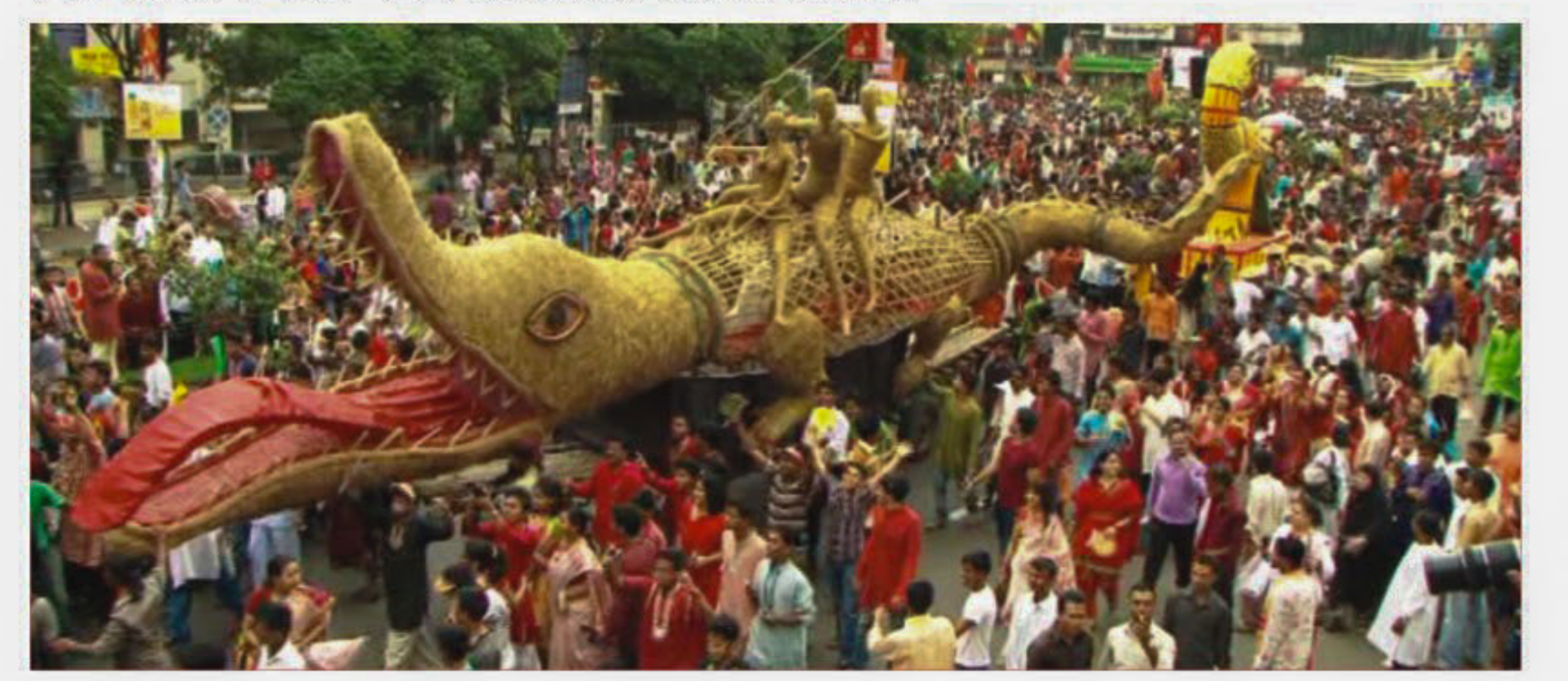
A scene from the documentary.

STAFF CORRESPONDENT A documentary made on the festivity and significance of the first day of Bangla calendar, Pahela Baishakh, received an award at the First Impchal International Short Film Festival 2012. The documentary, also titled "Pahela Baishakh", received the Best Documentary Award at the festival held from April 15 to 18 at the capital city of the Indian state of