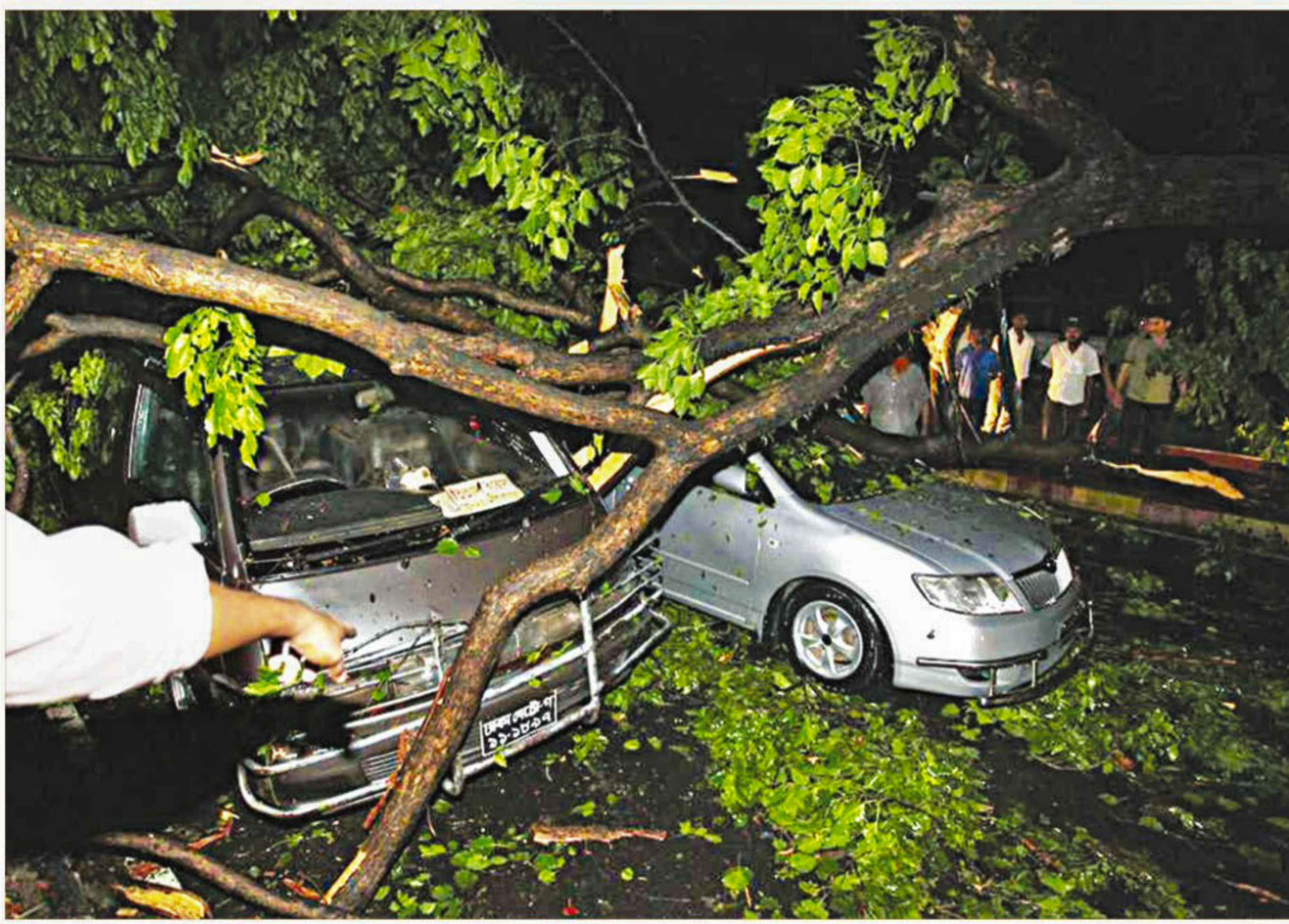
Tree branches come crashing down on vehicles on Hare Road in the capital yesterday evening during the nor'wester that swept over Dhaka. A rickshaw puller lost his life on Dhaka University campus when a branch fell on his rickshaw. His passenger is in grave condition at DMCH. Story on Page 2.