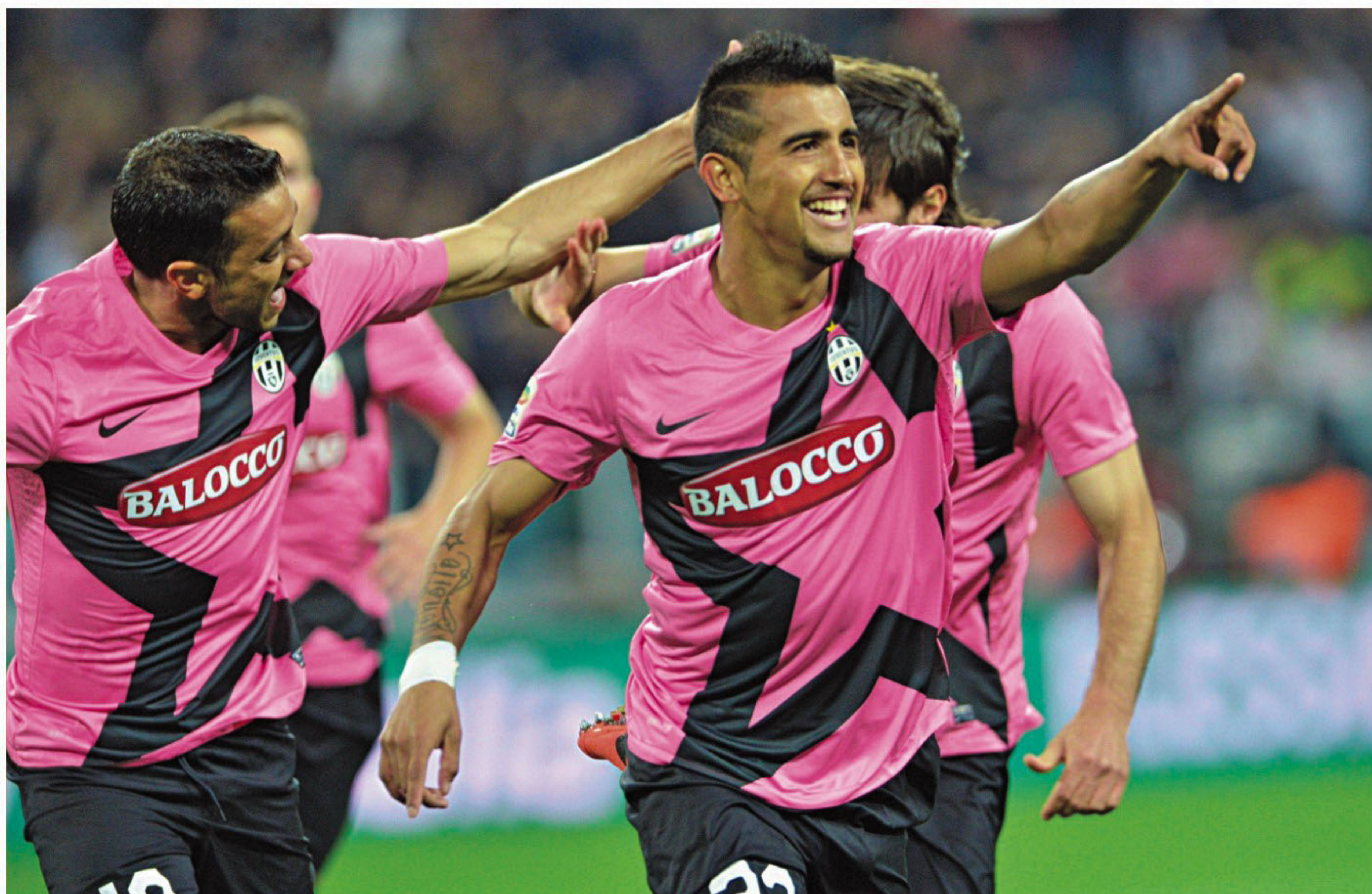
Juventus midfielder Arturo Vidal (R) celebrates one of his two goals against Roma during their Serie A encounter in Turin on Sunday.