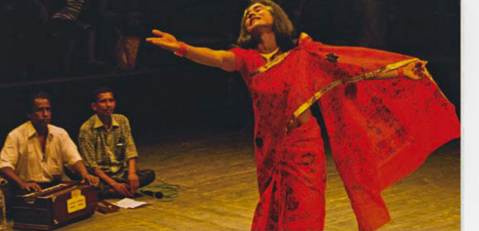
The pala is popular in greater Kushtia region.

Although "Nachhimon Pala" incorporates common elements of folktales, it is quite contemporary in its form. The depiction of the story is set in a