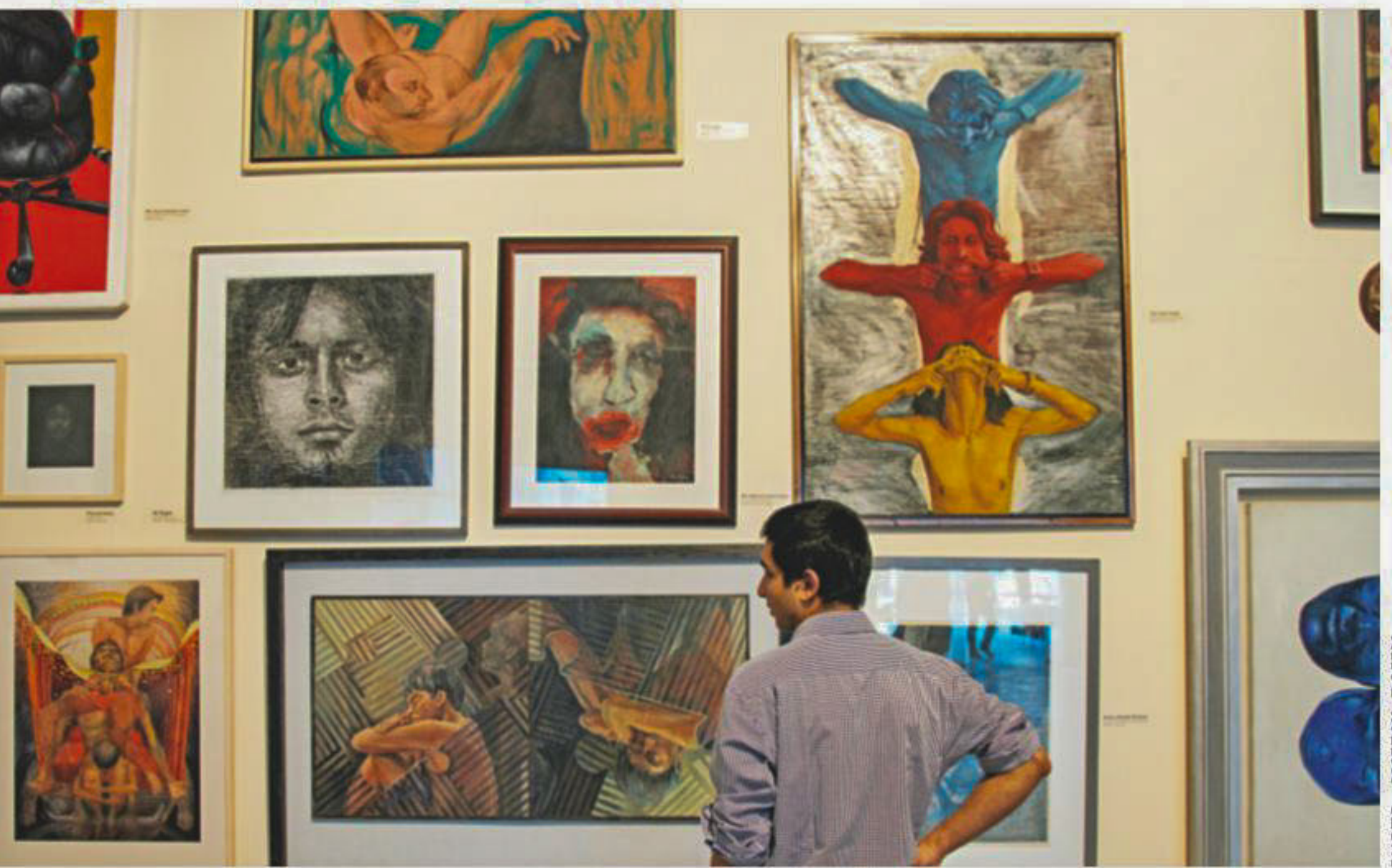
The Dhaka Art Summit showcased artworks by prominent and promising artists of Bangladesh.

"The art scene in the East is heating up, and we want to