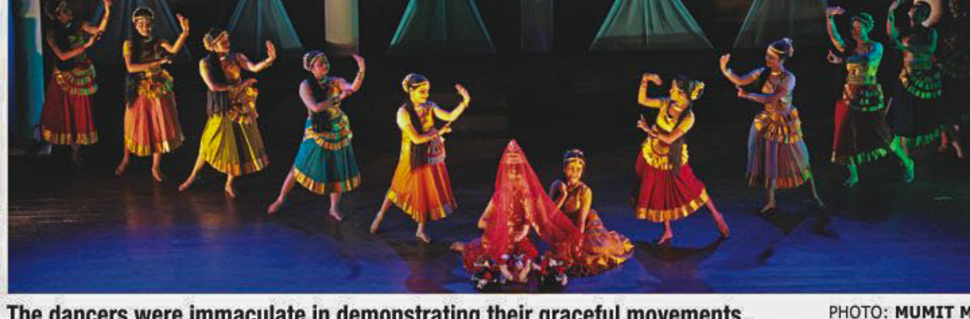
The dancers were immaculate in demonstrating their graceful movements.