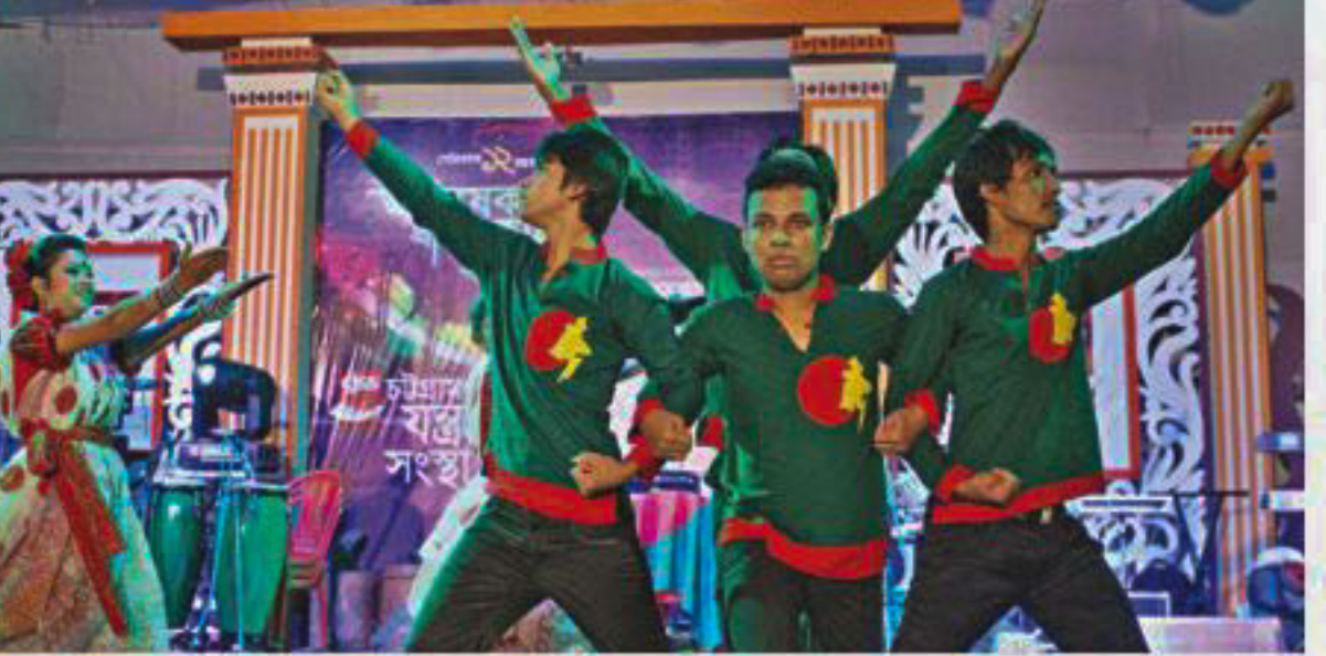
Dancers perform at the programme.