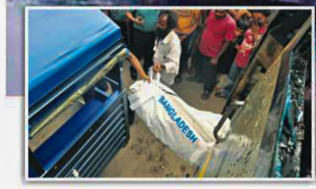
A bus at the capital's Khilgaon burns with its driver inside yesterday. Inset, police pull the charred body into a van.