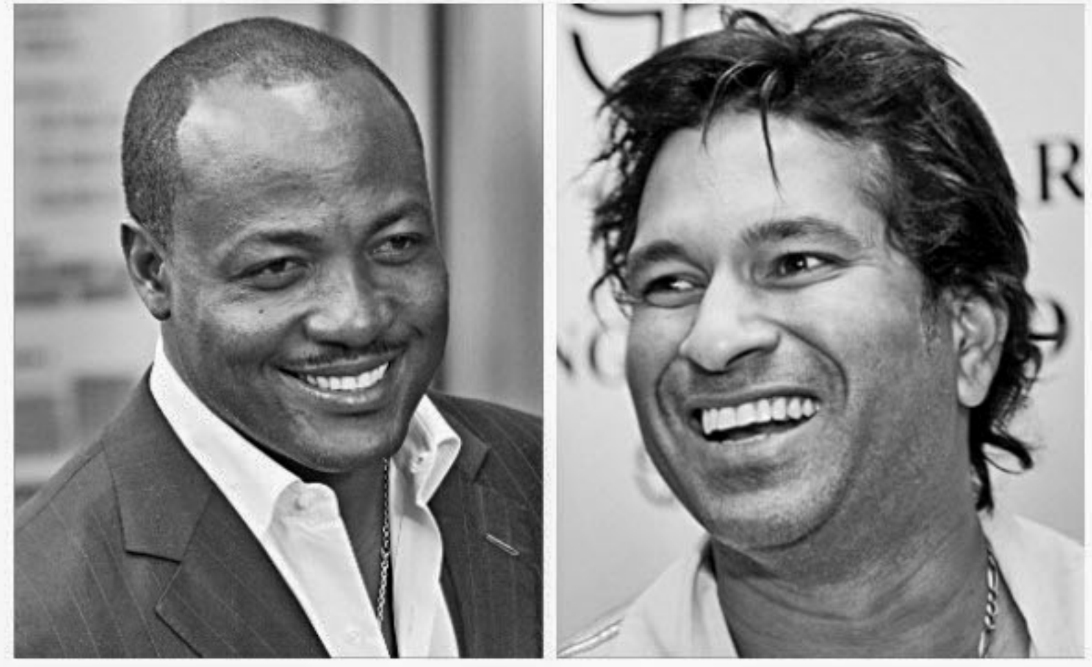
BRIAN LARA V SACHIN TENDULKAR

One innings, however great, out of 232, does not make a clutch player. The more practical facts of the matter show that Lara averages 61.02 in wins, to Tendulkar's 66.59. That Lara and Tendulkar are both great players is indisputable. The difference in quality between the two is infinitesimal. One could put Lara in Tendulkar's place in a team, or vice-versa, and there would probably be no change in the team's results. From the perspective of weaknesses and given that the strengths of the two players can be taken for granted, however, Tendulkar comes out comfortably ahead of the West Indian champion.