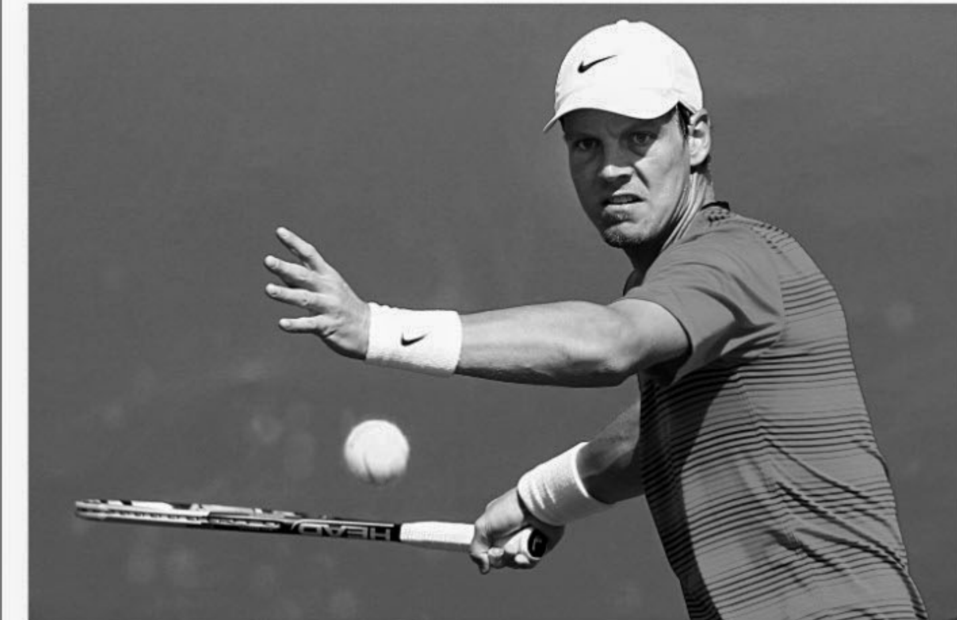
Czech Republic's Tomas Berdych hits a return against Andy Murray of Britain during their Monte-Carlo Masters Series match on Friday.

"At some points today I did well; some points I didn't do so well. It's going to take me a few weeks. Today is a good match to learn from because I was playing a top player who played very, very well."