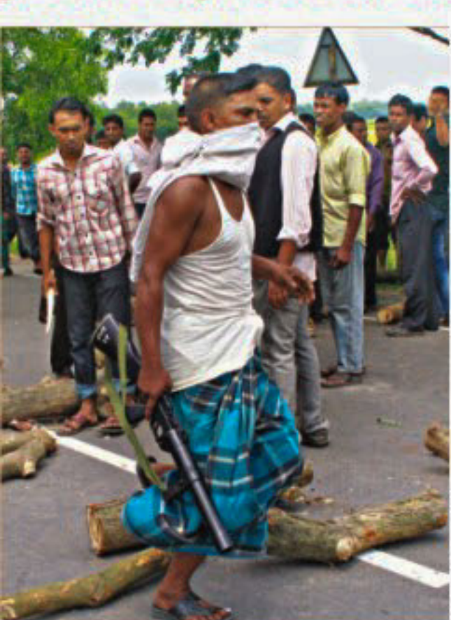
A supporter of Ilias with a tear-gas launcher, snatched from the police, during protests in Sylhet.

BNP calls hartal across country for Sunday, in Sylhet for today; claims agency men picked up its leader