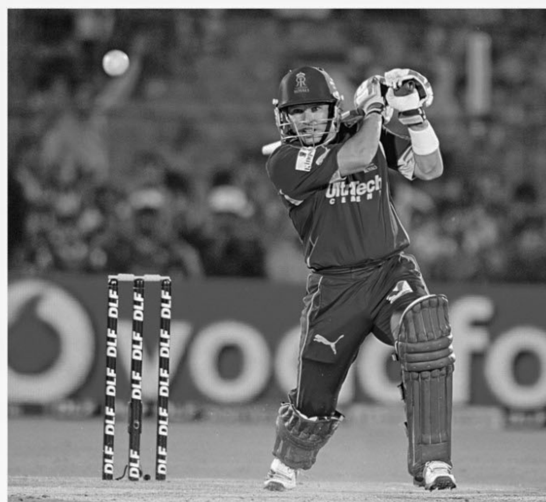
Rajasthan Royals batsman Brad Hodge plays a forcing shot through the covers during their IPL match against the Deccan Chargers at the Sawai Mansingh Stadium in Jaipur yesterday.

That explanation sounds quite absurd as one doubts whether the costs he can reduce will outstrip the expense of his added presence.