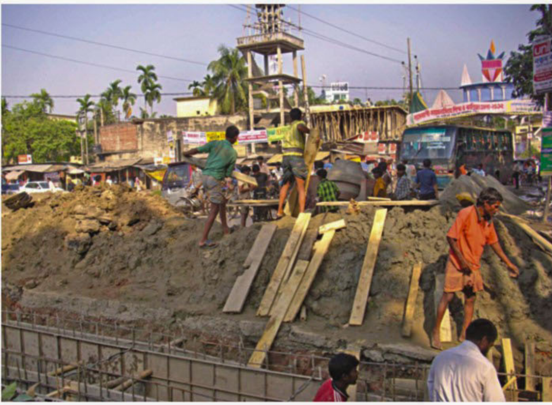
Dug out earth and construction materials are haphazardly kept on the road adjacent to Mominunnesa Government Girls' College in Mymensingh town, much to the trouble of commuters and pedestrians, especially the students attending the ongoing HSC examinations.

Agricultural economists from WRC in Dinajpur are involved in the project works including data collection and validation of survey results.