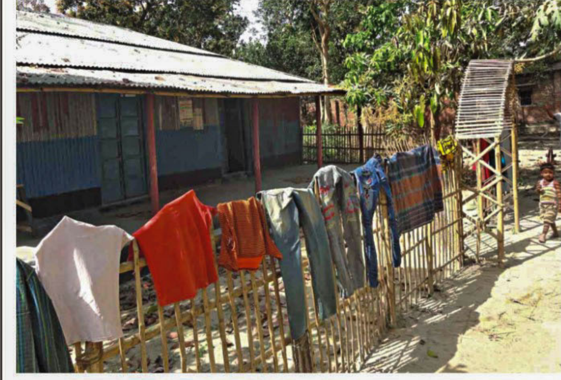
This 150-year-old mosque near the 'zero line' at Srikrishnapur village under Hili police station of Dakkhin Dinajpur in Indian state of Pashchimbanga serves as the symbol of fraternity among residents of several neighbouring villages on both sides of the India-Bangladesh border as a good number of Muslims of the area offer daily prayers there.