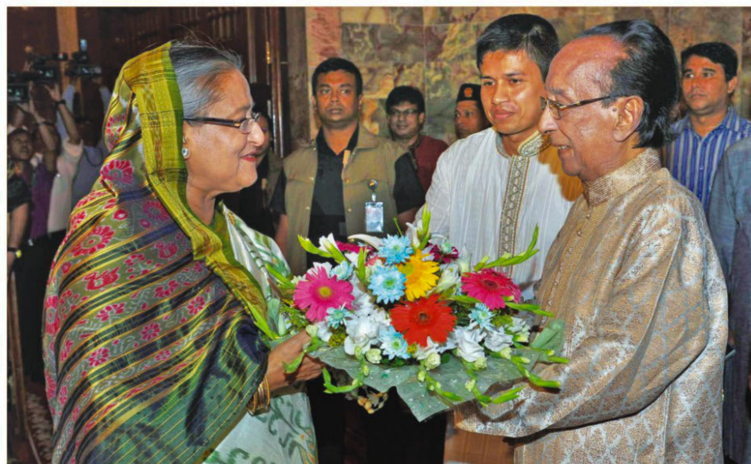
President Zillur Rahman welcomes Prime Minister Sheikh Hasina with bouquet at Bangabhaban in the capital yesterday on the occasion of the Pahela Baishakh.