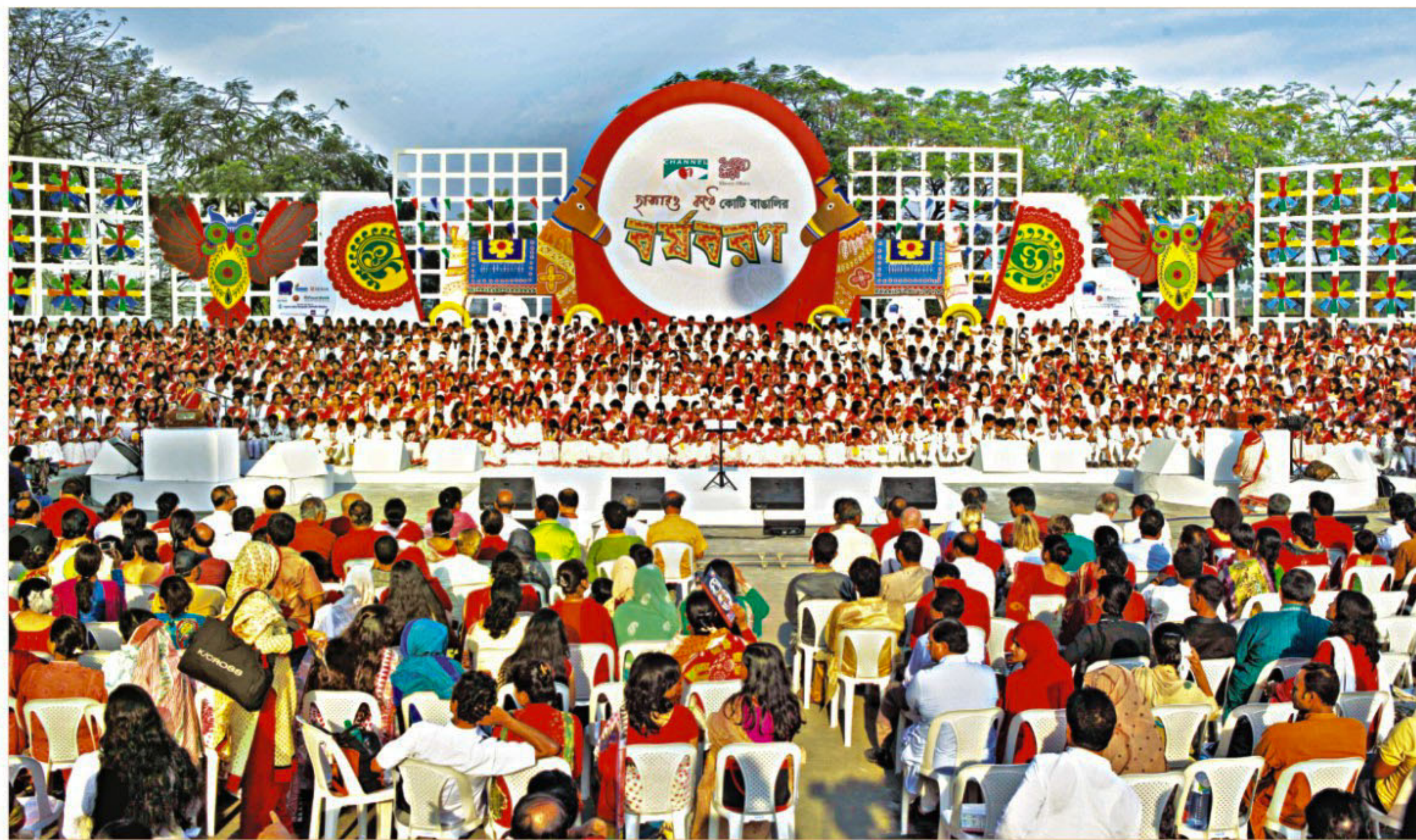
Channel i, a satellite private TV channel, celebrates Pahela Baishakh through a cultural programme titled "Hajaro Kanthe Koti Bangalee Barshobaran" at Bangabandhu International Conference Centre in the capital on Saturday.

FRF Diagnostic and Research Centre, a non-profitable organisation, organised the camp on the occasion of Pahela Baishakh, the first day of Bengali new year, says a press release.