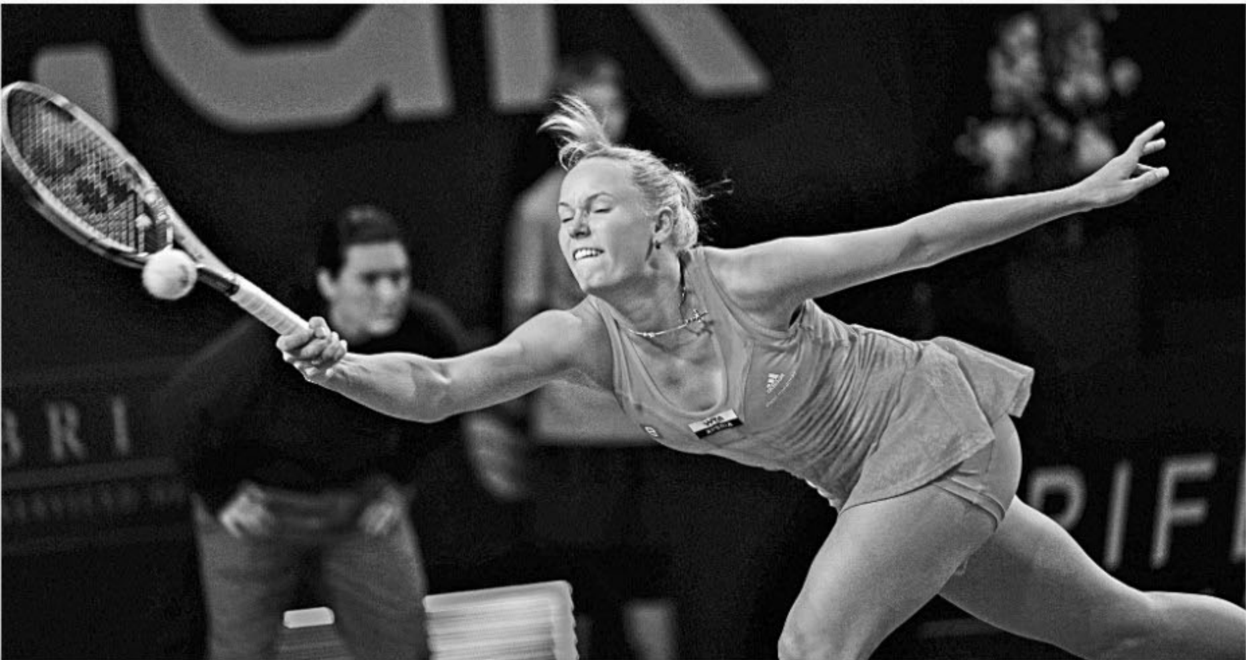
Caroline Wozniacki of Denmark stretches to make a forehand return against Pauline Parmentier of France in the Danish Open in Copenhagen on Thursday.