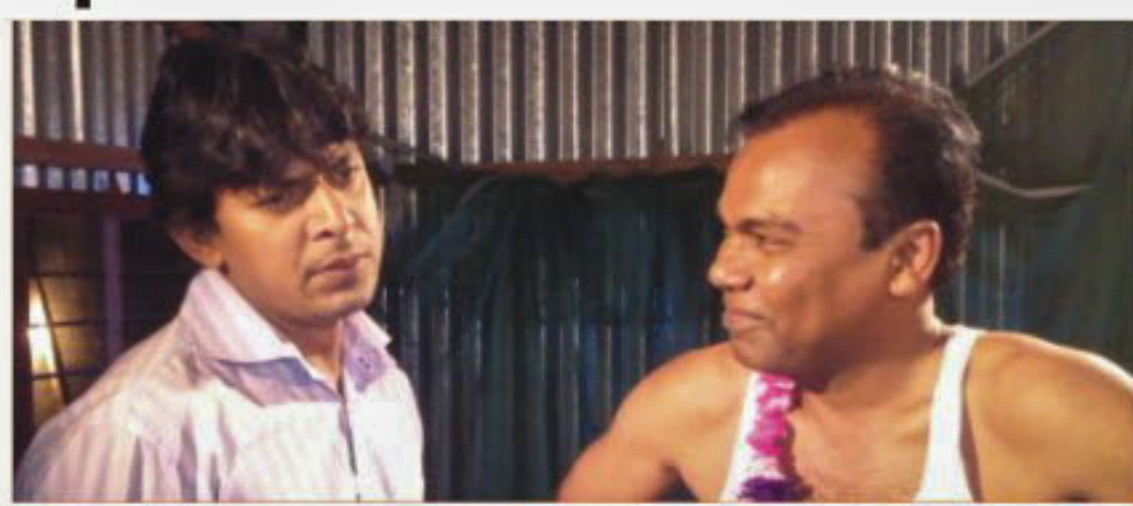
A scene from "Sharer Lorai".