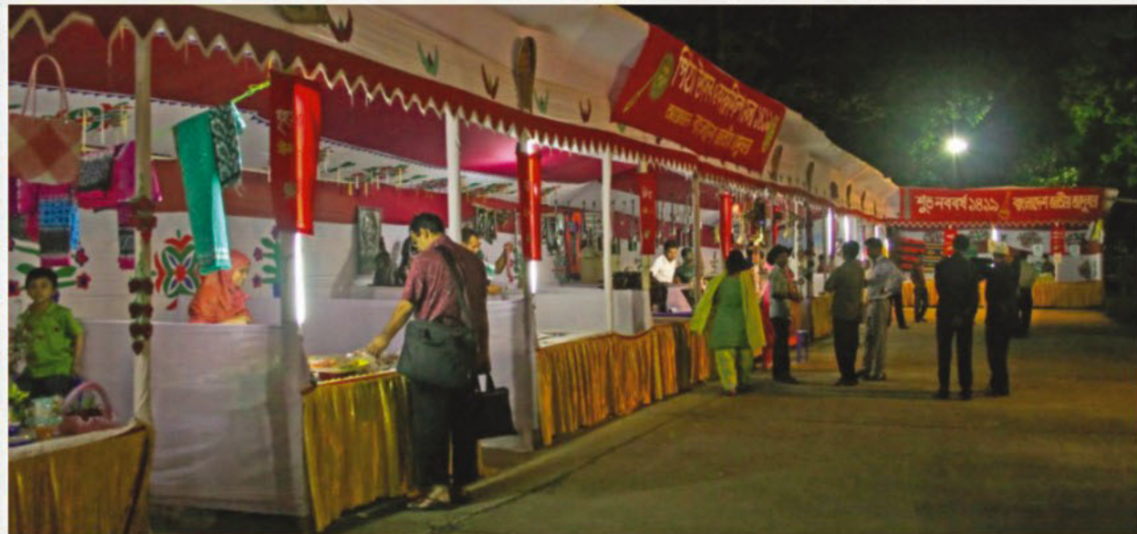
The fair seldom gets the much-needed publicity or enough turnouts to ensure good sales.