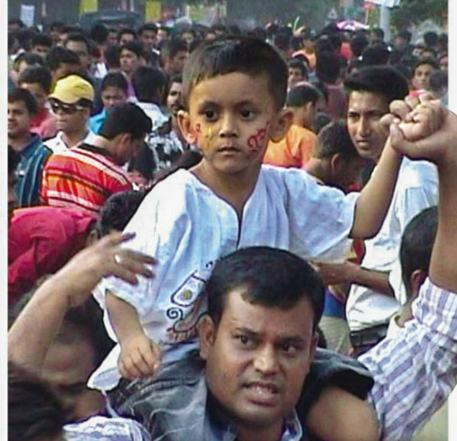
A scene from the documentary.