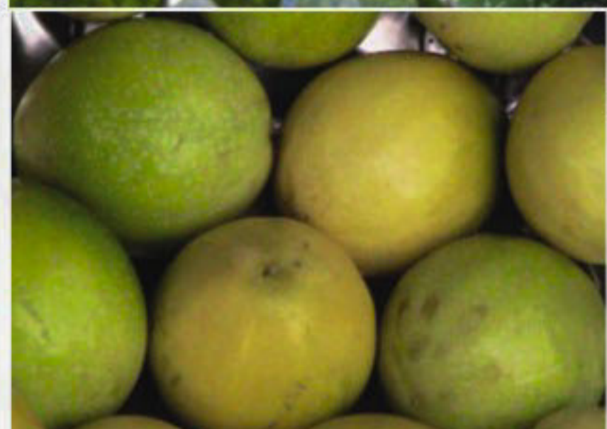
Passion fruits, locally known as 'tang phal,' cultivated by Mohsin Ali of Baniapara under Chilahati union in Debiganj upazila of Panchagarh