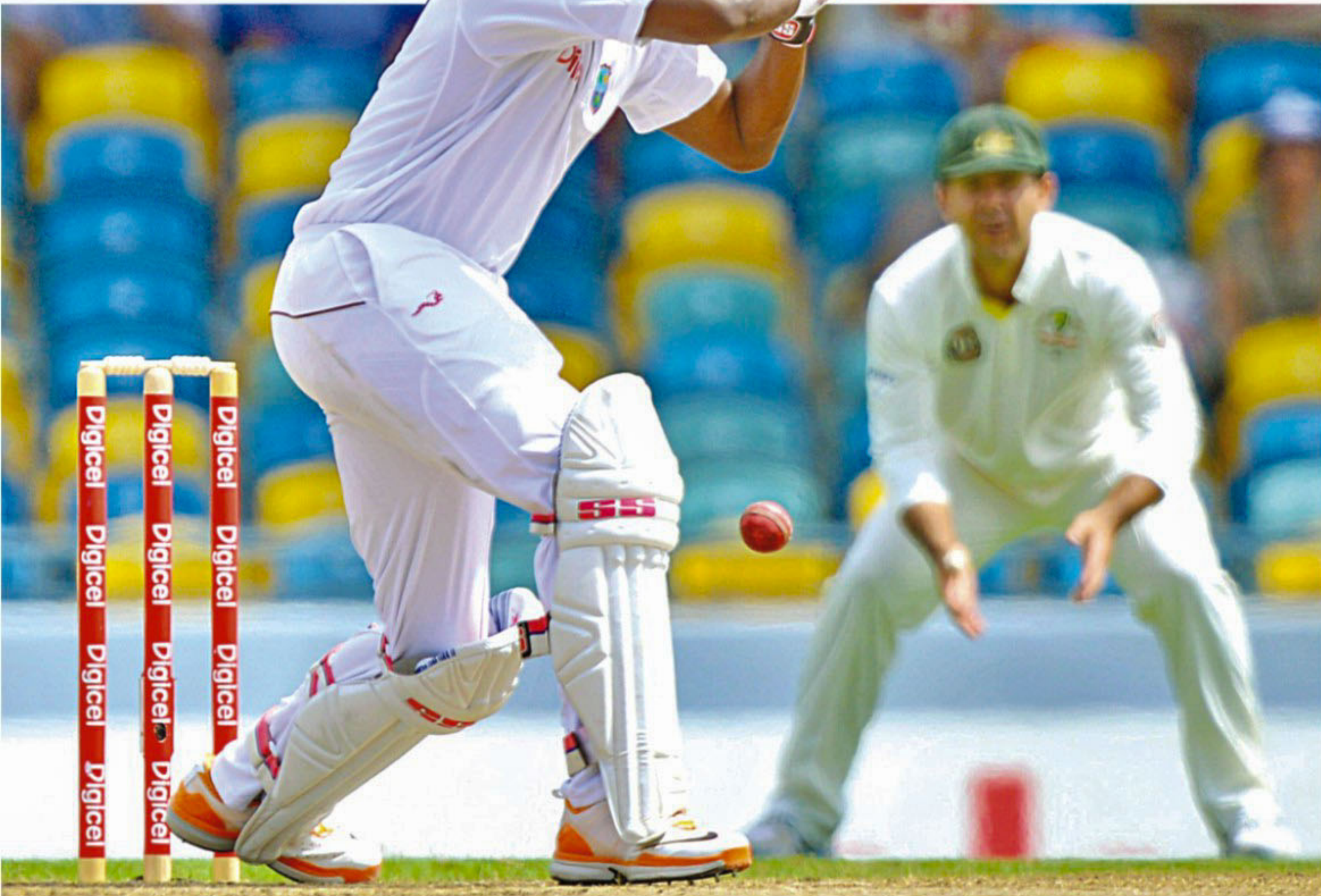
PATIENCE IS VIRTUE: West Indies batsman Darren Bravo leaves a delivery just outside the off stump during his patient knock of 51 on the second day of the first Test against Australia at the Kensington Oval in Bridgetown yesterday.