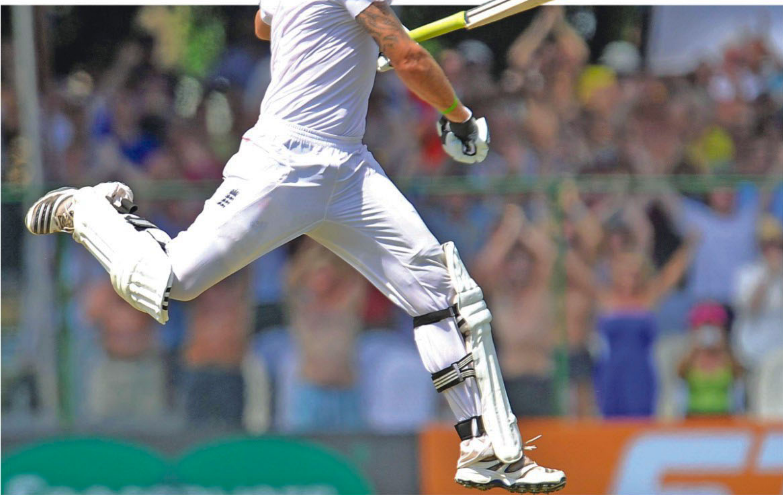
England batsman Kevin Pietersen celebrates after reaching an aggressive century during the third day of the second Test against Sri Lanka at the P Sara Oval in Colombo yesterday.