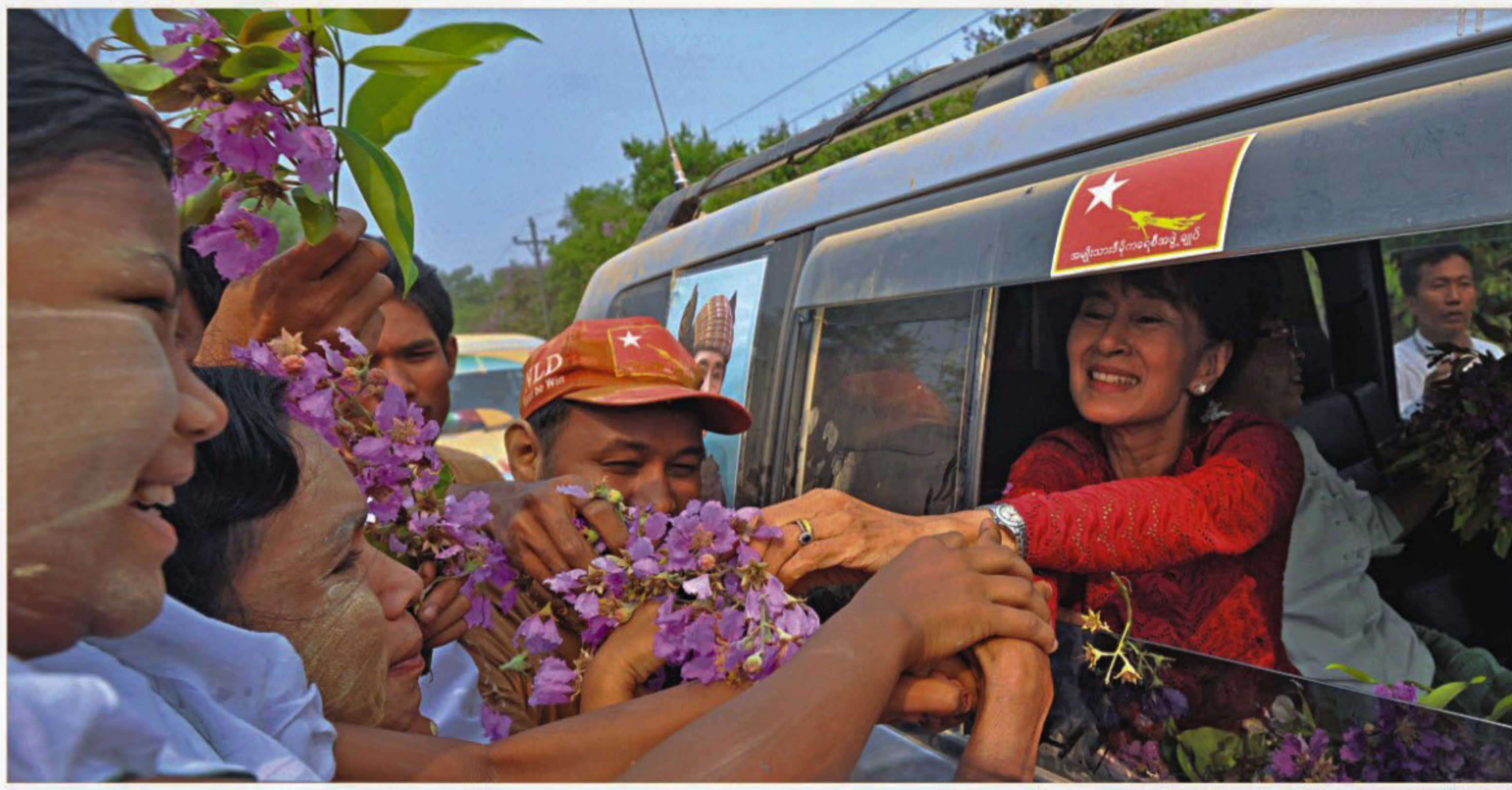
Supporters greet Myanmar's democracy icon Aung San Suu Kyi yesterday as she travels across Kawhmu, the constituency where she is a candidate.