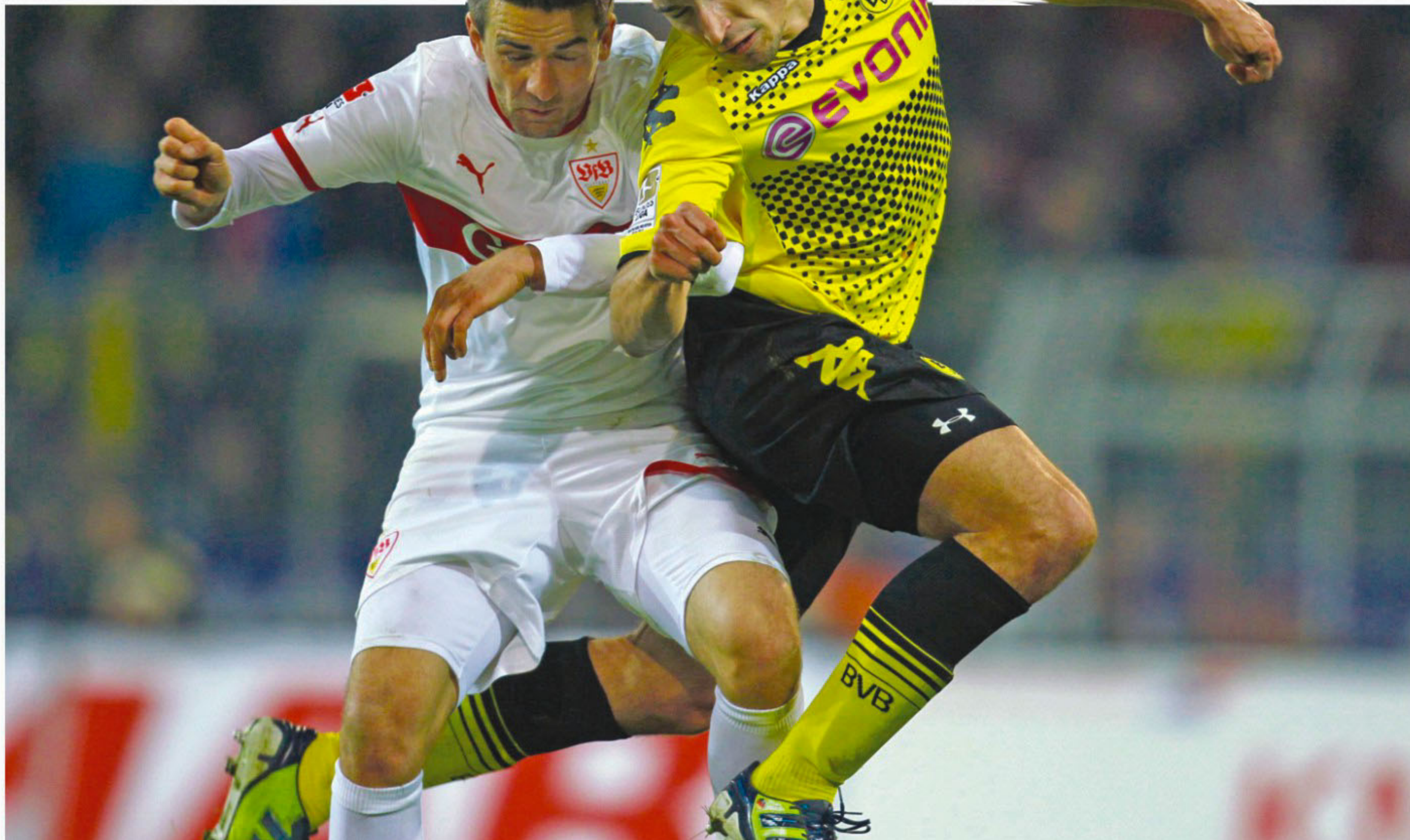
Borussia Dortmund defender Mats Hummels (R) is locked in an aerial tussle with Stuttgart striker Vedad Ibisevic during their Bundesliga encounter in Dortmund on Friday.

Perisic then put Dortmund ahead five minutes later before Gentner's dramatic strike shared the points.