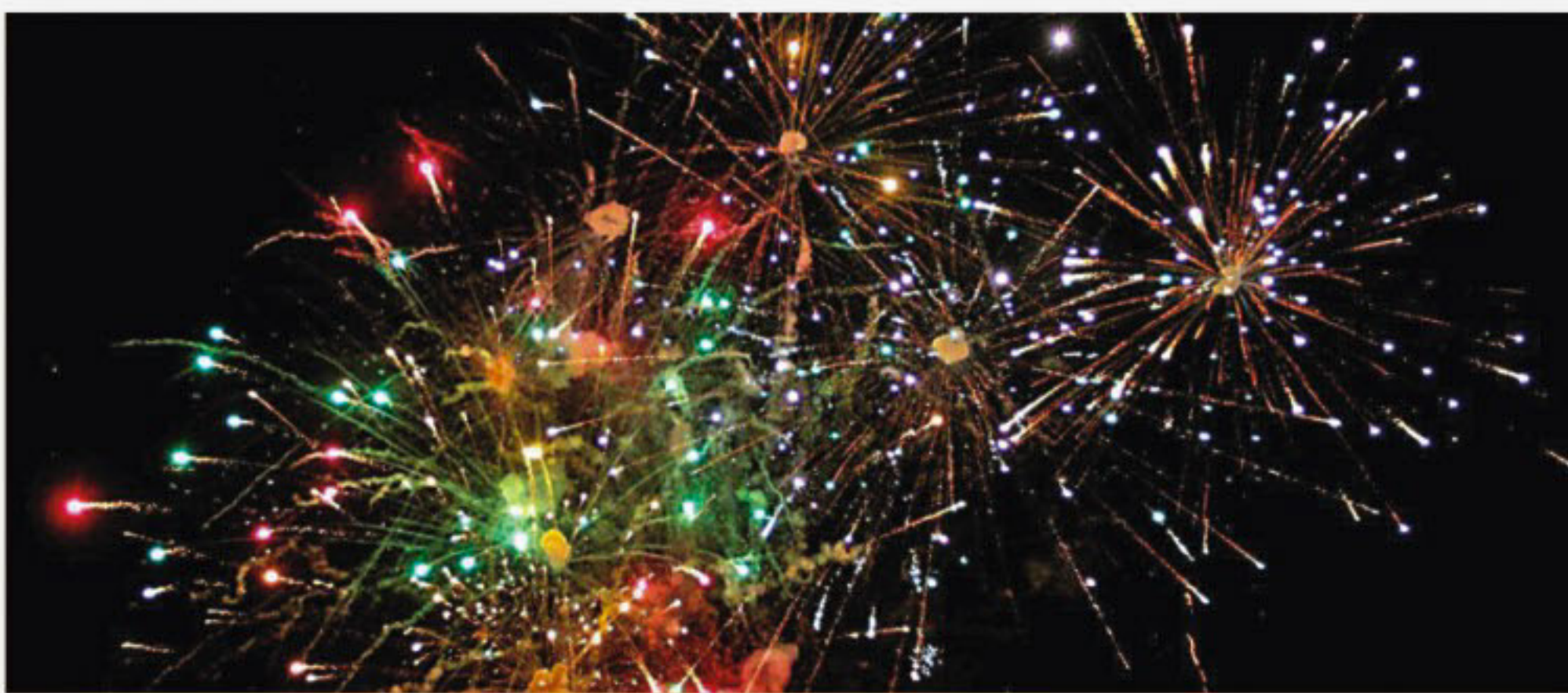
An aesthetic razzle-dazzle, including fireworks display and laser show, caused great excitement among the enthusiastic audience.

The Daily Star Odommo Chattagram Festival in full swing