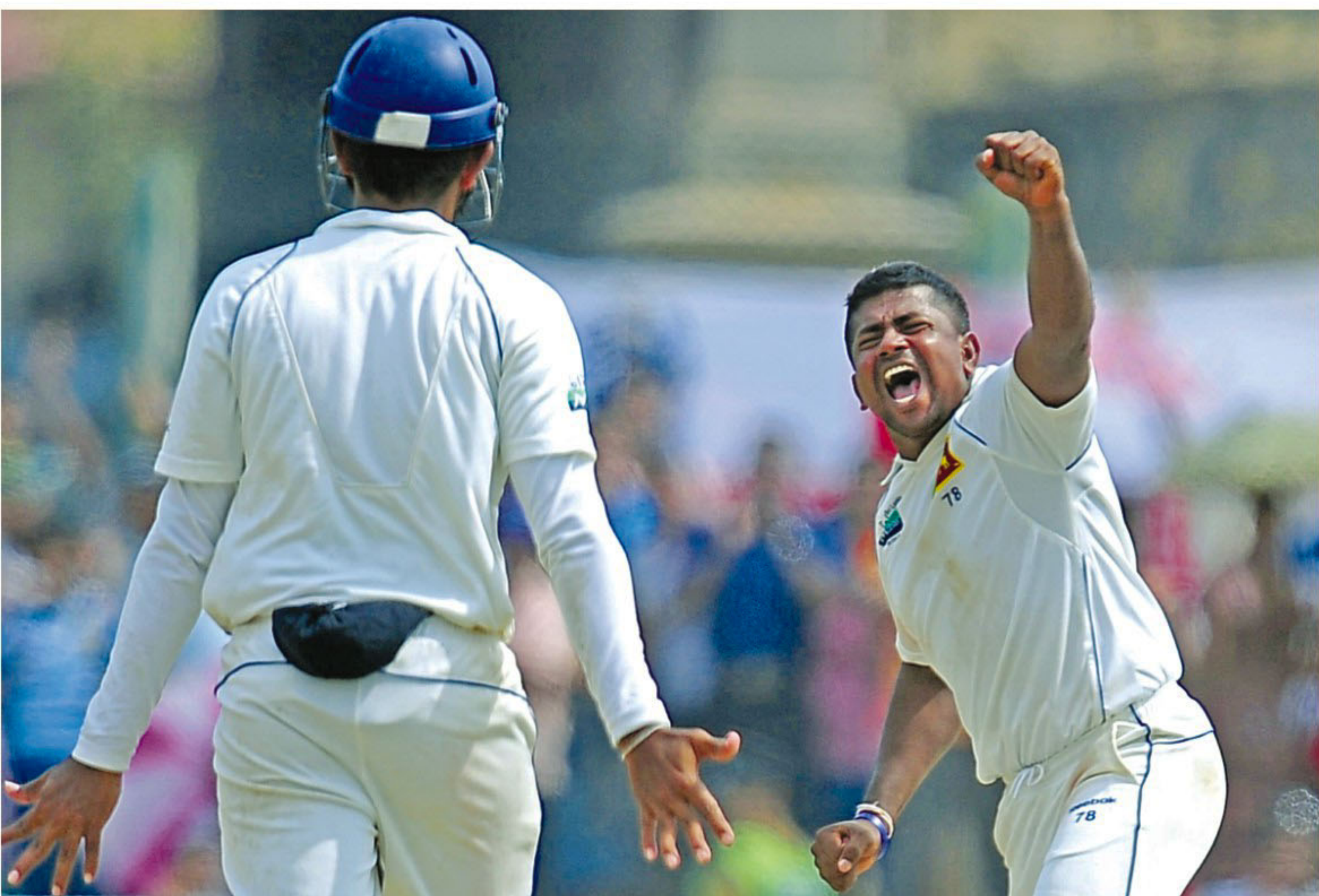
Sri Lanka's left-arm spinner Rangana Herath (R) is overjoyed after claiming the wicket of England batsman Graeme Swann, his sixth in the innings, during the fourth day of the first Test at the Galle International Stadium yesterday.

The champions will be awarded Tk 25,000, runners-up Tk 15,000 and best player Tk 5,000.