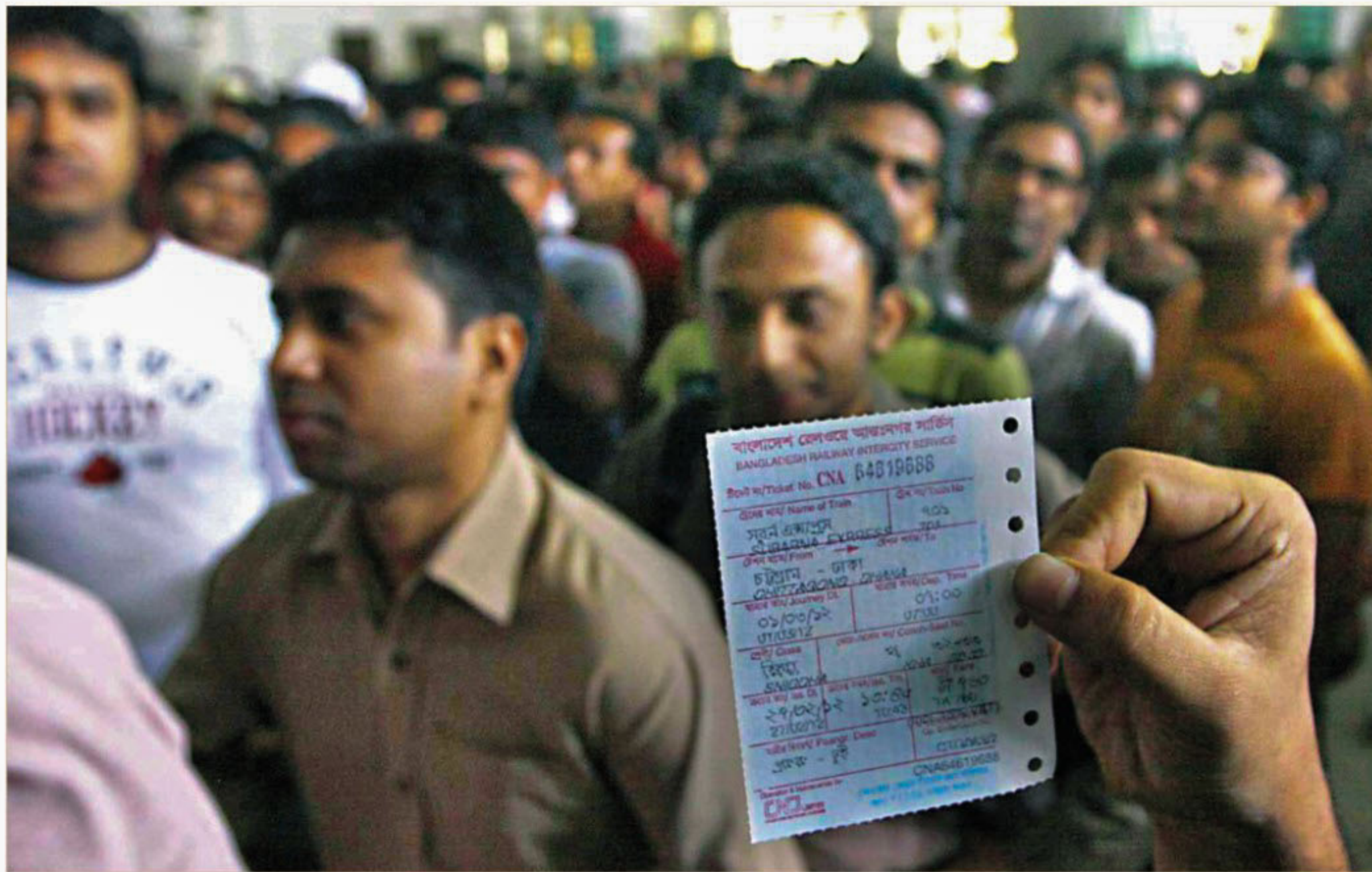
People stand in a long queue at Chittagong Railway Station to get train tickets. Tickets like this one are very precious as scalpers have taken over. People quite often fail to get tickets waiting in line for hours.