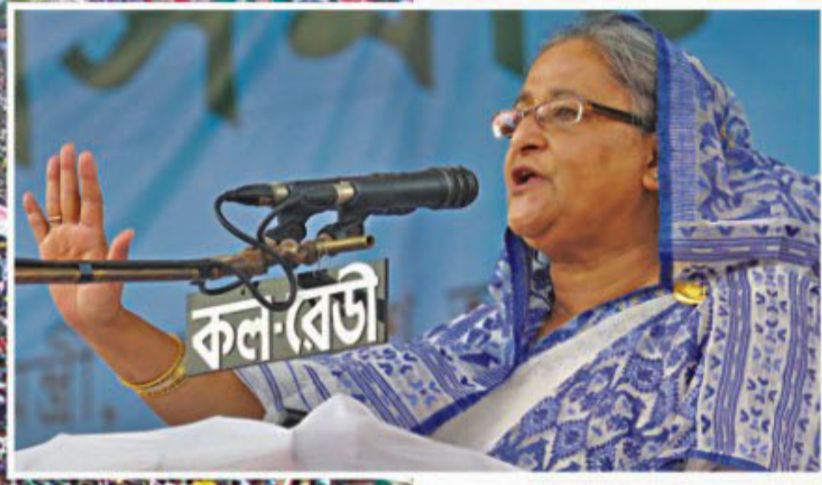
People thronged the Polo Ground in Chittagong yesterday for the Awami League rally addressed by party president and Prime Minister Sheikh Hasina.