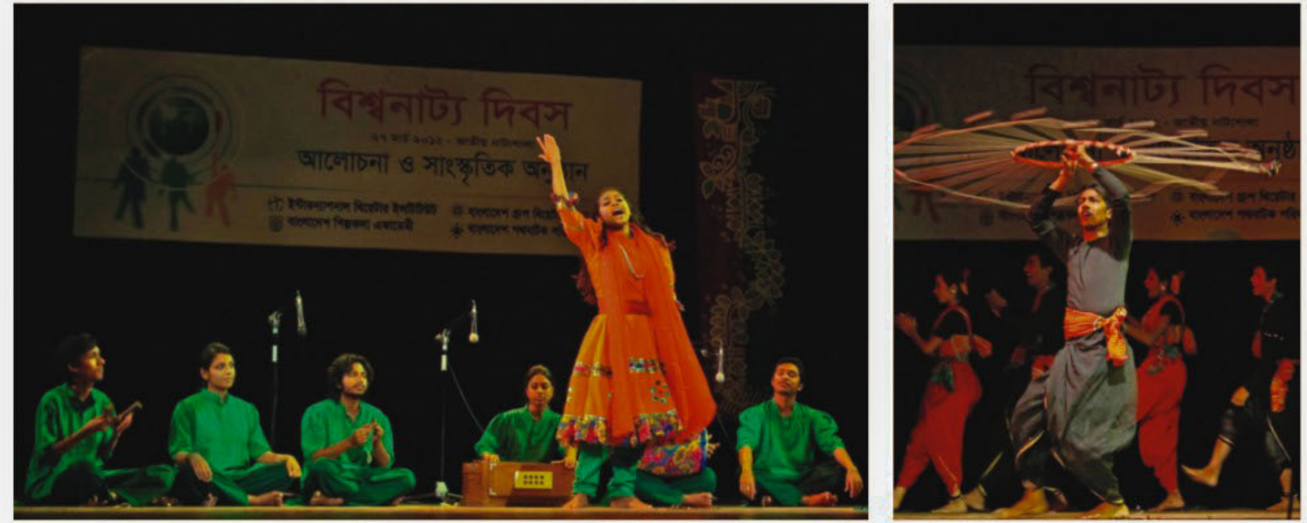
(Clockwise from top) Desh Opera stages jatrपालa at the TIB programme. Demonstrations by Bhabna and DU students.

groups that took part at a festival organised jointly by The Daily Star and BGTF last year. Representatives of the troupes collected the crests.