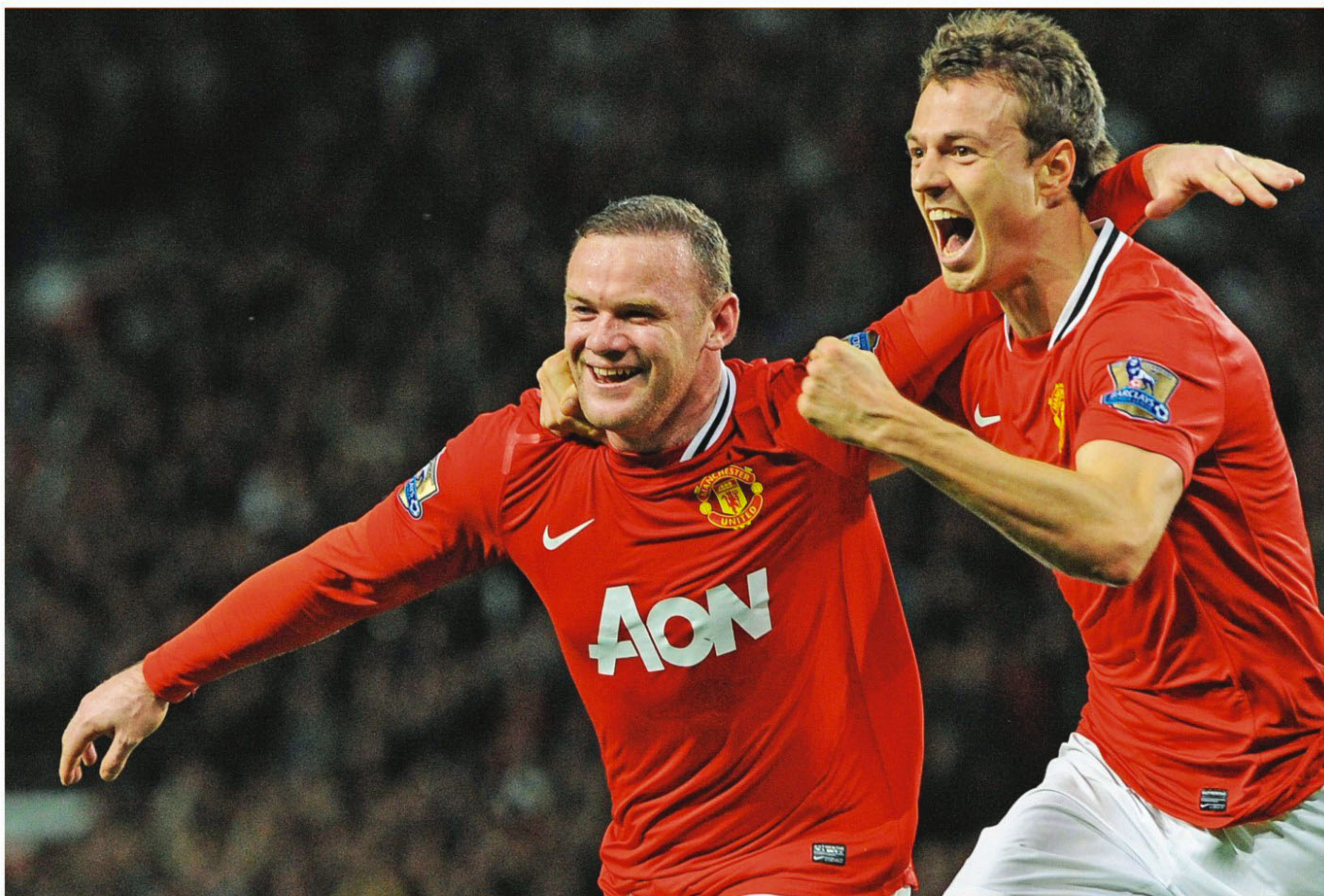
Manchester United star Wayne Rooney (L) celebrates his all-important goal with teammate Jonny Evans during their Premier League encounter against Fulham at Old Trafford on Monday.

But the ruthless finishing which was so evident eight days earlier at Molineux was missing as Fulham created just as many chances as United before the interval.