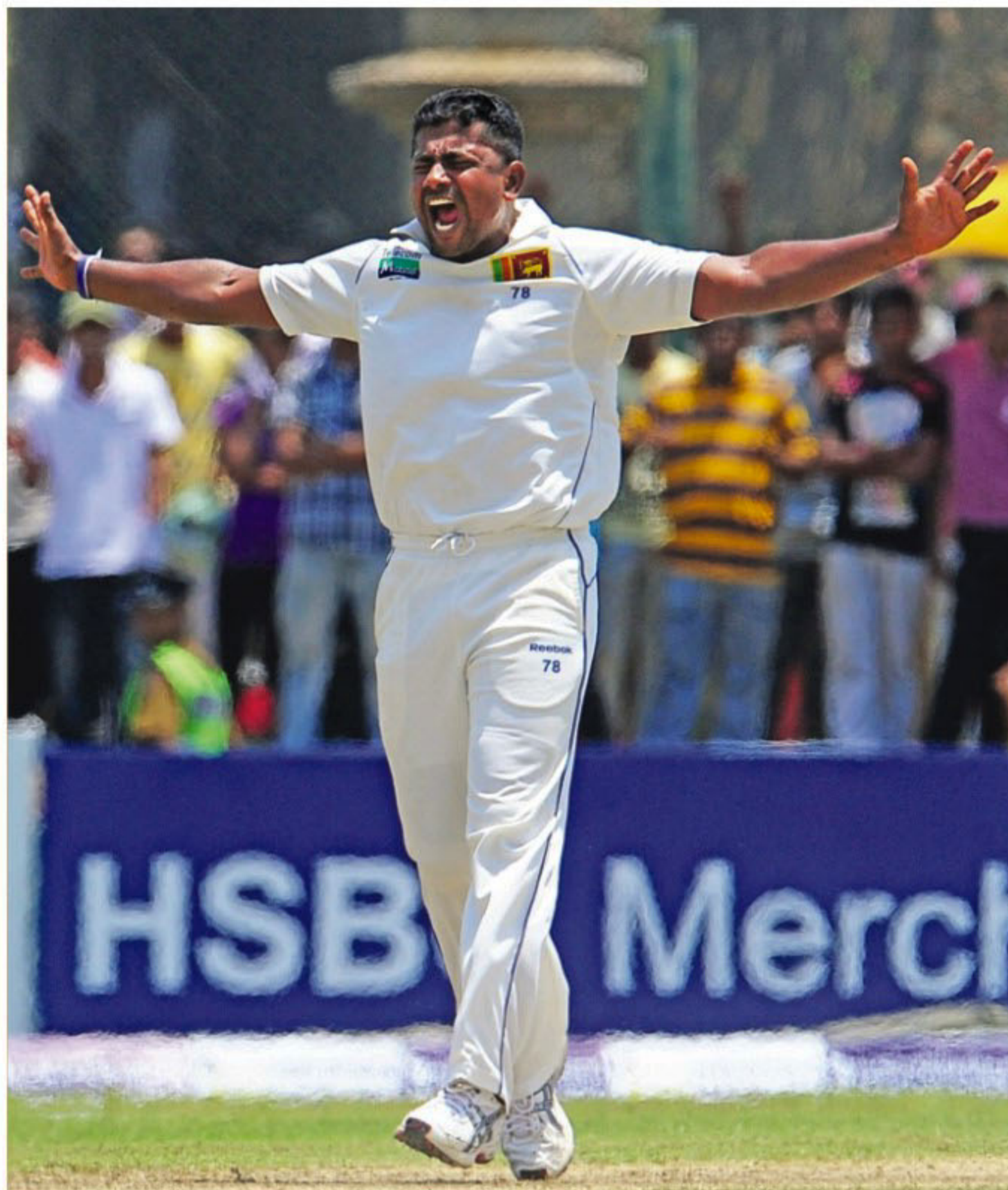
Sri Lanka spinner Rangana Herath successfully appeals for the wicket of England batsman Matt Prior during the second day of the opening Test at the Galle International Stadium yesterday. Herath took six wickets to dismiss England for 193 in the first innings.