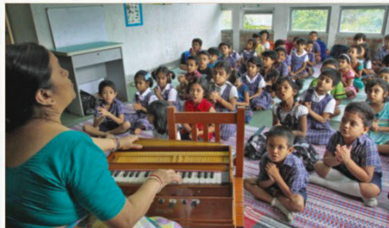
Fulki, a model school of Chittagong, has been offering education of an enlightened sort to its students for the last 36 years.