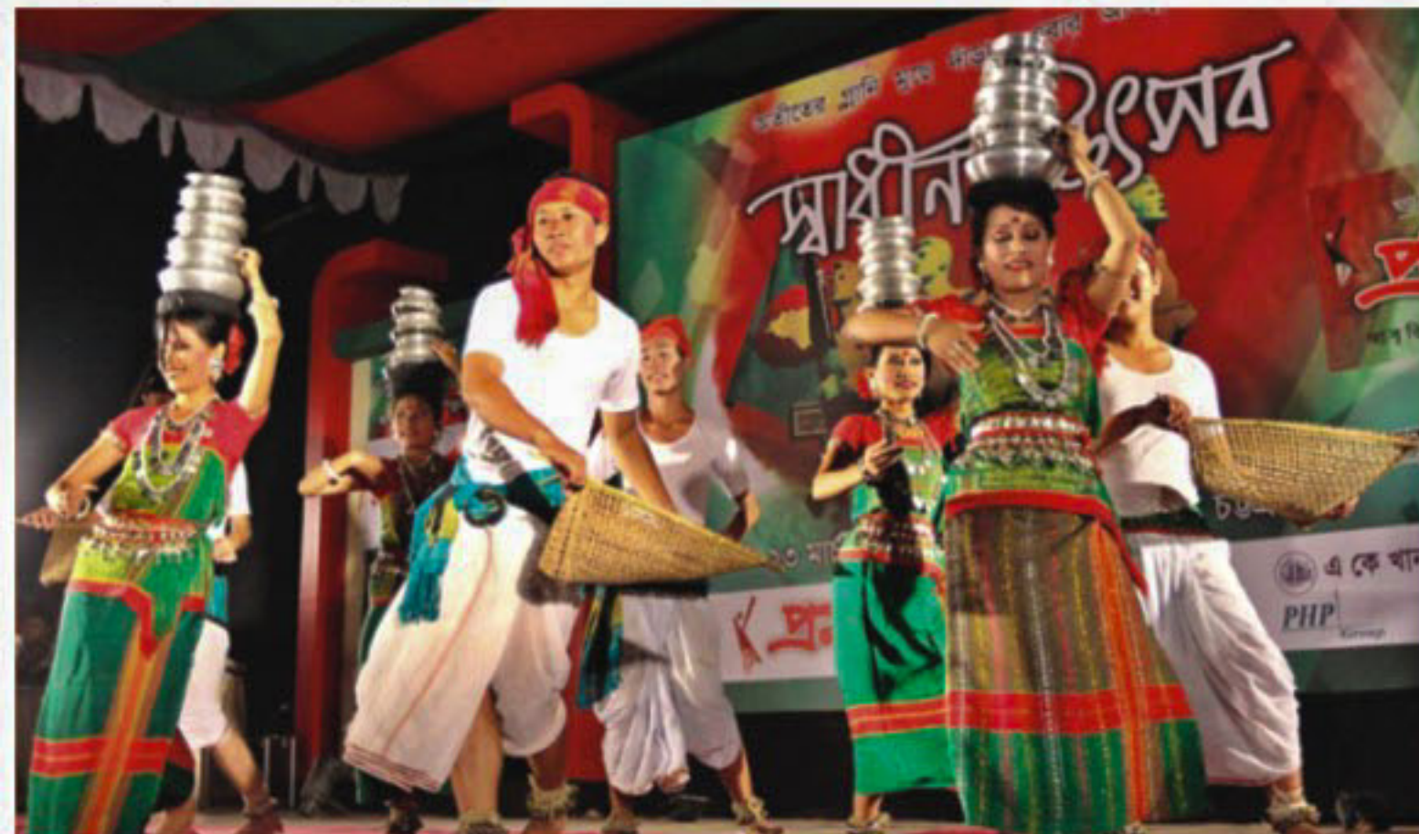
Dancers give a pulsating performance at DC Hill in Chittagong commemorating Independence Day.

Patriotic forces stand firm against war criminals