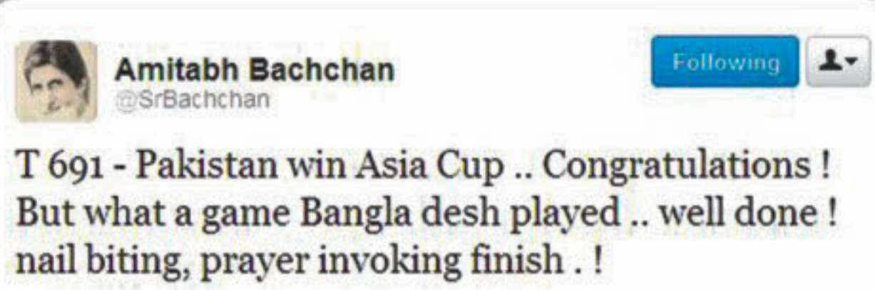
T 691 - Pakistan win Asia Cup .. Congratulations ! But what a game Bangla desh played .. well done ! nail biting, prayer invoking finish . .

One of the greatest batsmen in cricket history, Brian Lara, said in his Facebook page status that he got emotional watching the players shed tears: "I felt very sad seeing the people and the players crying. Could be either ways. Bangladesh lost, but won the hearts of million people, in fact they won everything except the Cup! Be aware world, Bangladesh is the new terror!"