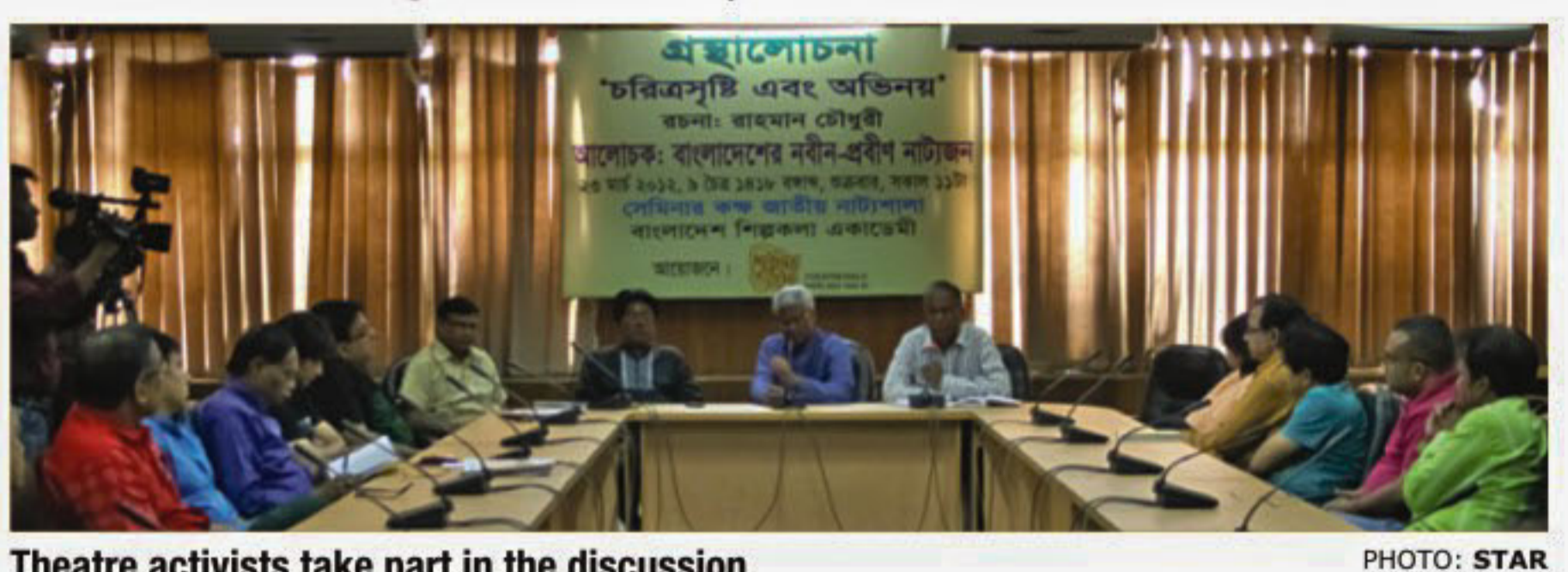
Theatre activists take part in the discussion.