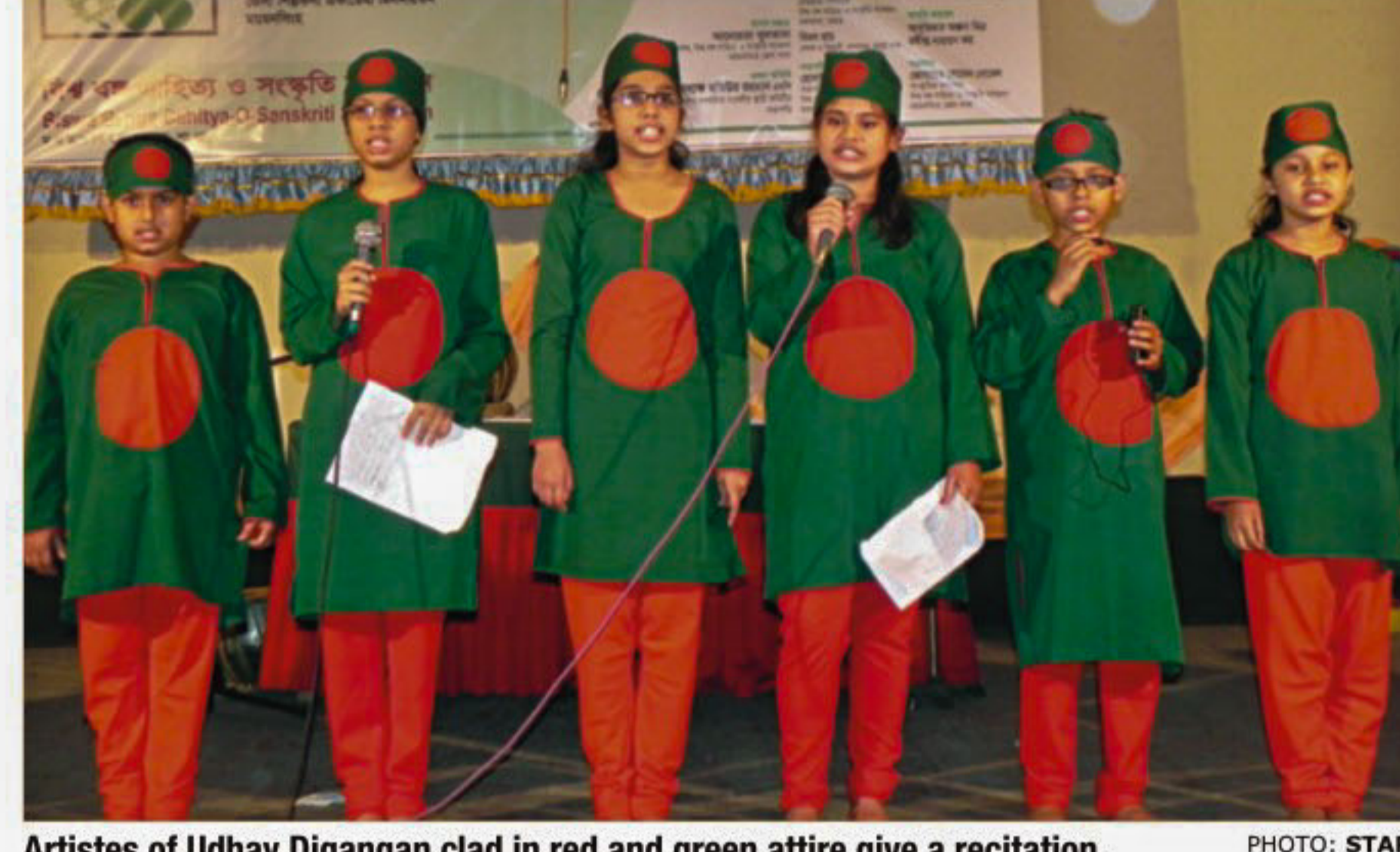
Artistes of Udhay Digangan clad in red and green attire give a recitation.

AMINUL ISLAM, Mymensingh A conference of Biswa Banga Sahitya O Sangskritik Sammelon (BBSS) was held at the district Shilpakala Academy Auditorium recently. BBSS is an organisation of Bengali speaking people cutting across countries. Mymensingh district unit of BBSS organised the programme. Marking the conference the local unit held programmes, including discussion, rendition of classical music, dance, poetry recitation and a play.