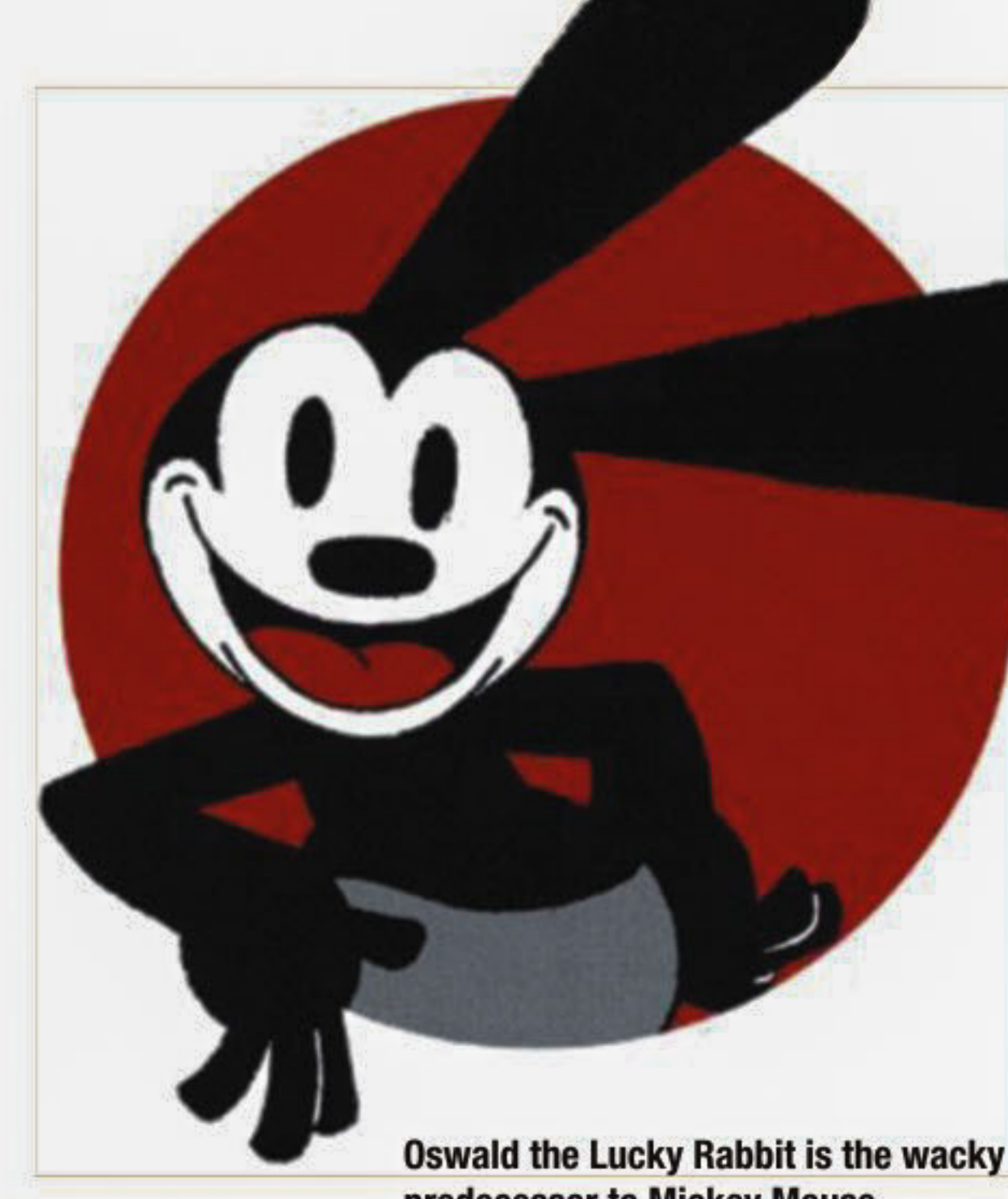
Oswald the Lucky Rabbit is the wacky predecessor to Mickey Mouse.