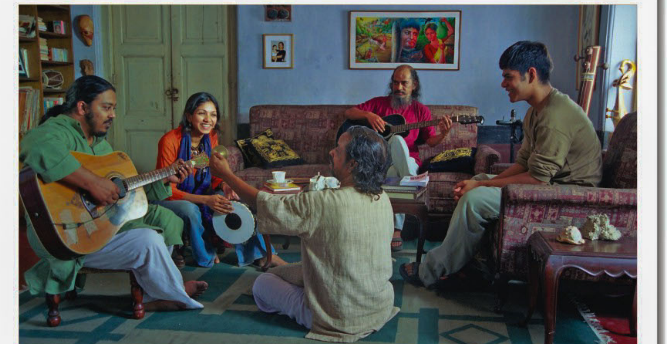
A scene from "Ontorjatra".

"Runway" was released February 10 in Dhaka. Since then the film has been screened at various venues around the city and the country. It was also recently screened on March 14 as the inaugural film of the International Social Communication and Cinema Conference organised by the West Bengal Government in Kolkata.