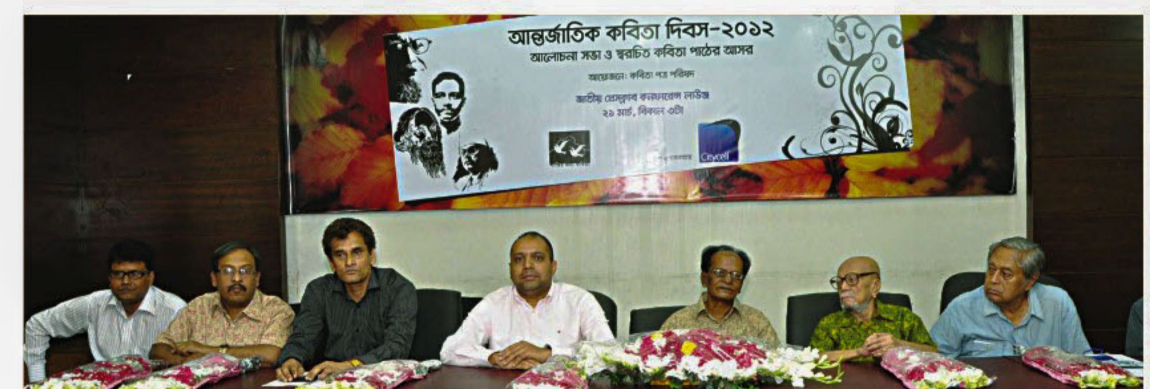
Poet Al Mahmud (2-R) with the guests at the programme.