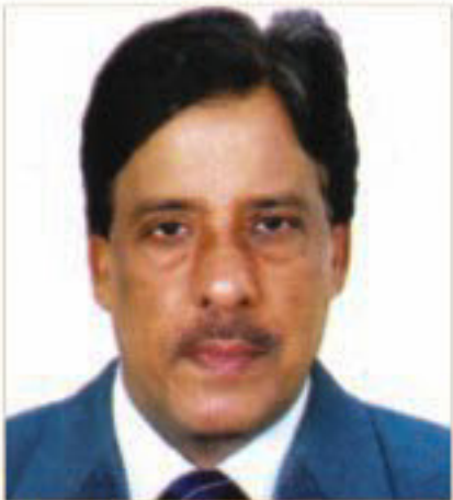
Justice Kabir: possible chief of new tribunal

Jamaat leader Azharul shown arrested in 8 other cases