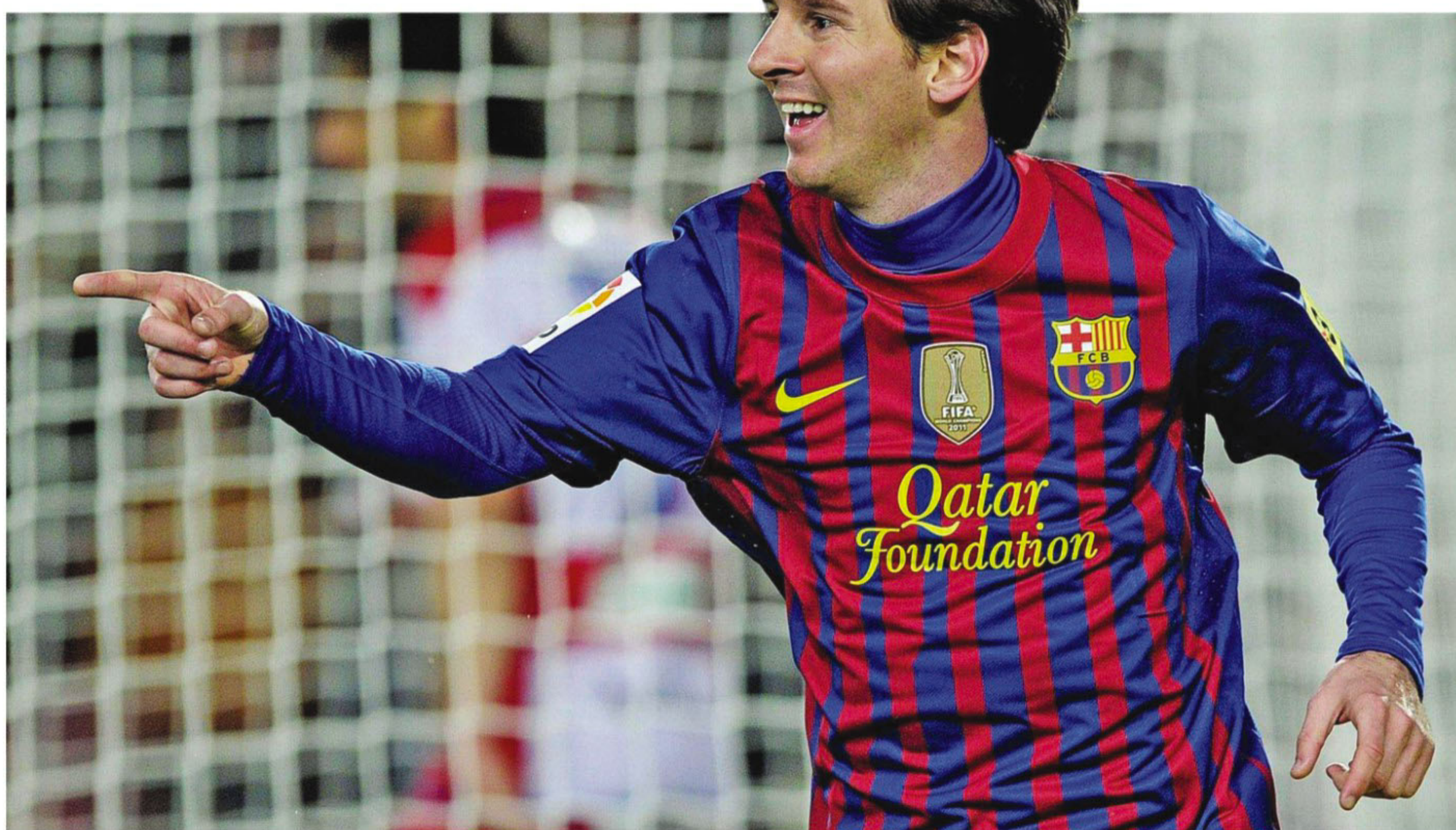
Barcelona superstar Lionel Messi celebrates one of his three goals during their Primera Liga encounter against Granada at Nou Camp on Tuesday. Messi became Barcelona's all-time leading scorer with 234 goals.

Messi, who made his debut for the first team in October 2004, has scored 153 goals in the Liga, 49 in the Champions League, 19 in the Copa del Rey, eight in the Spanish Super Cup, one in the European Super Cup and four in the Club World Cup.