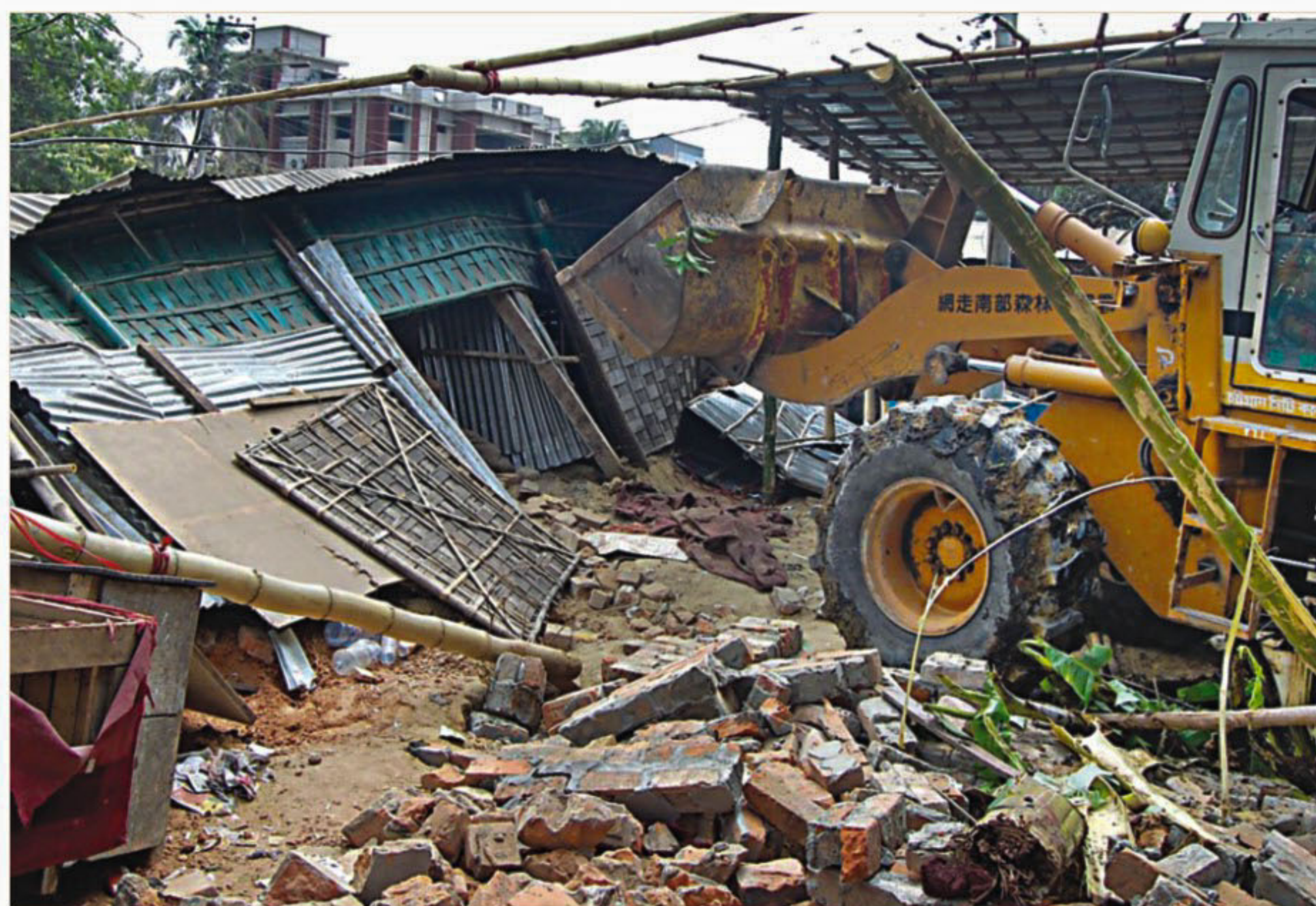
Chittagong City Corporation (CCC) demolishes illegal structures in the port city yesterday.

He left behind his wife, two sons and a host of friends and well-wishers to mourn his death.