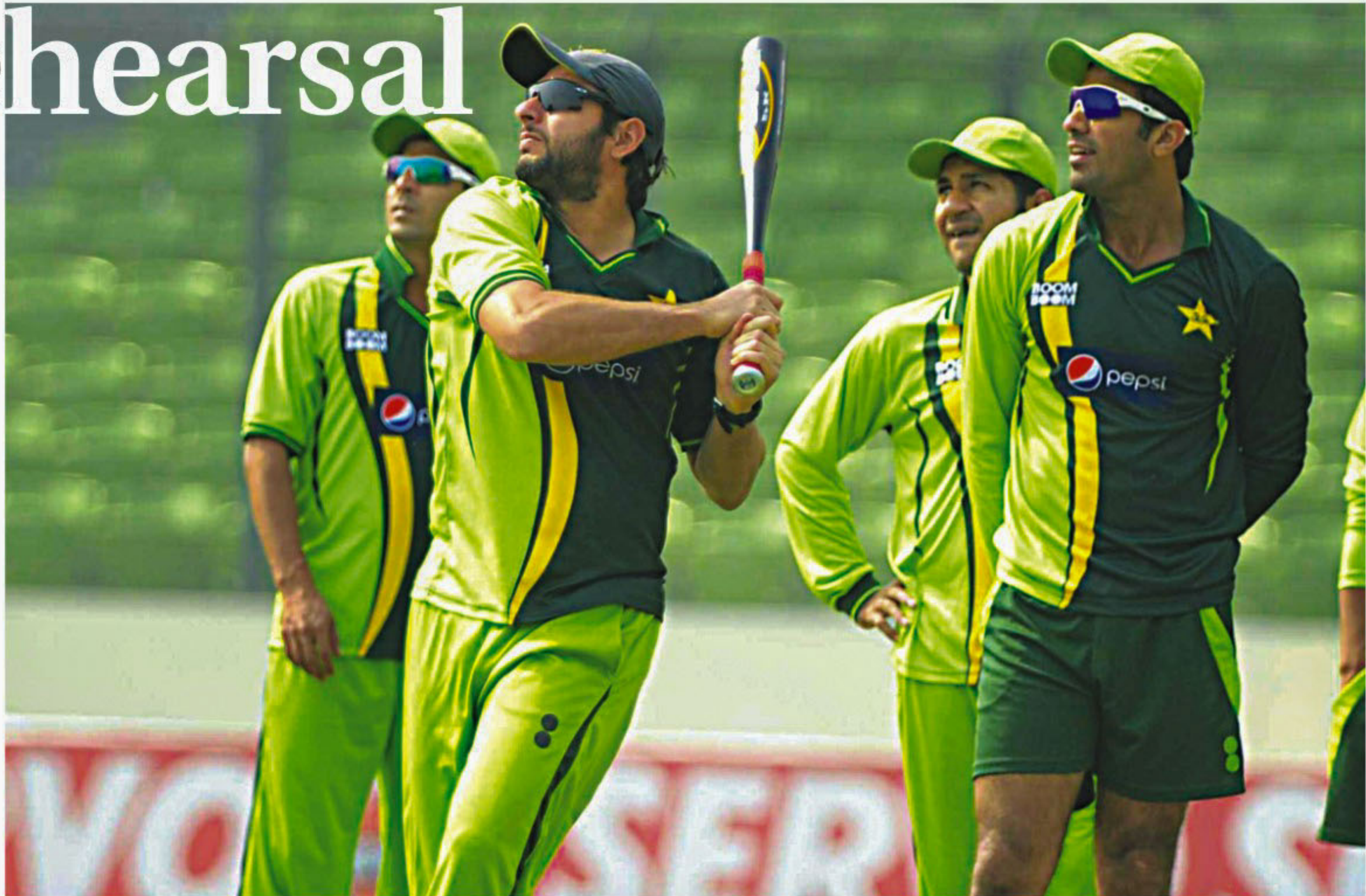
HIGH AND HANDSOME: Pakistan all-rounder Shahid Afridi hits one high with a baseball bat as his teammates and coaching staff look on during a practice session at the Sher-e-Bangla National Stadium in Mirpur yesterday. Pakistan will take on archrivals India, who did not practise yesterday, in a marquee clash of the Asia Cup here today.