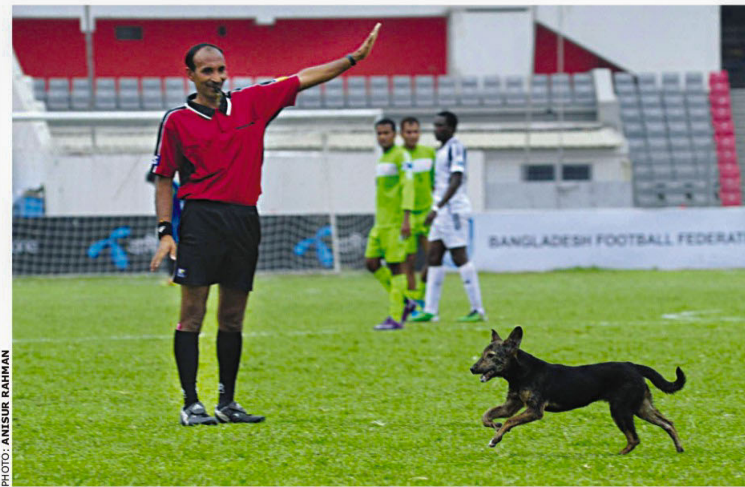
DOG DAY AFTERNOON: A match official shows a stray dog the exit during yesterday's Grameenphone Bangladesh Premier League match between Mohammedan and Team BJMC at the Bangabandhu National Stadium. However, the canine proved a hard one to officiate as it kept coming back onto the pitch, holding up play for a couple of minutes.