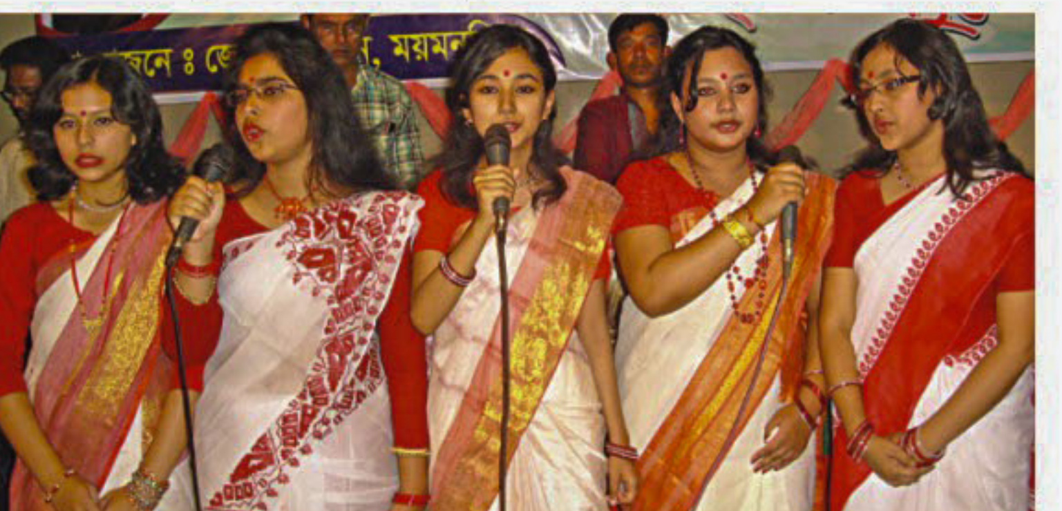
Artistes perform at the programme.