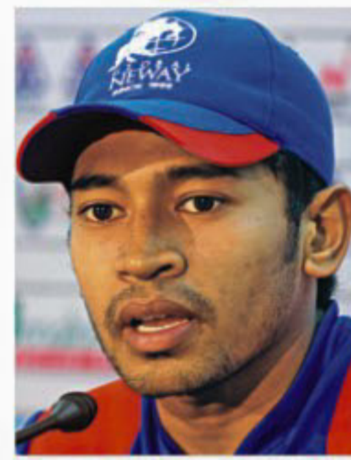
Bangladesh captain Mushfiqur Rahim speaks to reporters ahead of the Tigers' Asia Cup match against India.