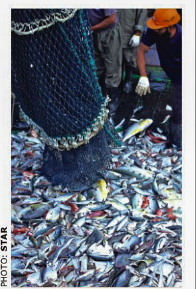
Bangladesh now gets more fishing area in the Bay.