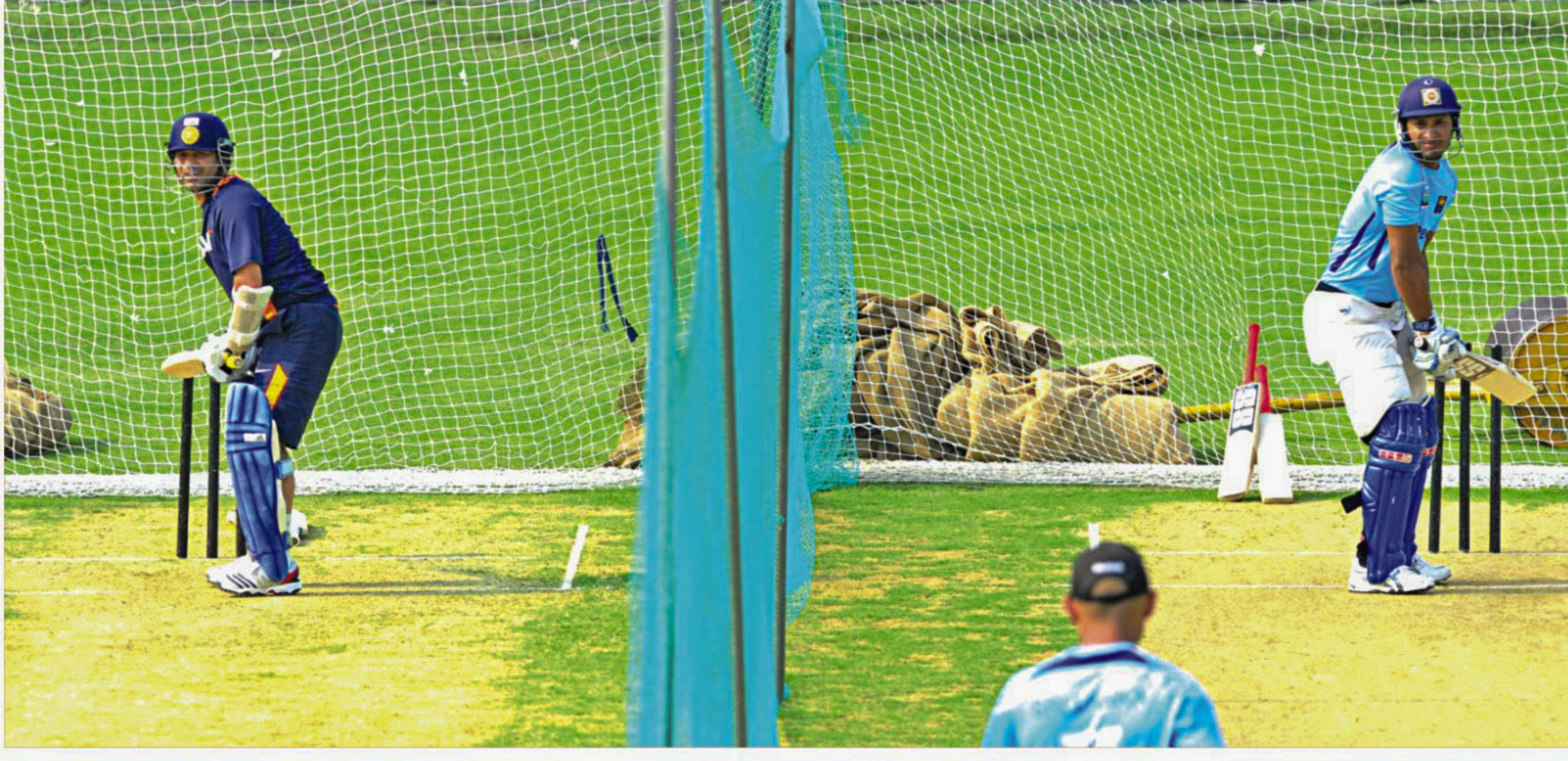
India's master batsman Sachin Tendulkar (L) knocks at the practice facilities of the Sher-e-Bangla National Stadium in Mirpur alongside Sri Lanka's wicketkeeper batsman Kumar Sangakkara yesterday. The Indian little master concentrated hard as he attended an optional practice session along with three of his teammates.