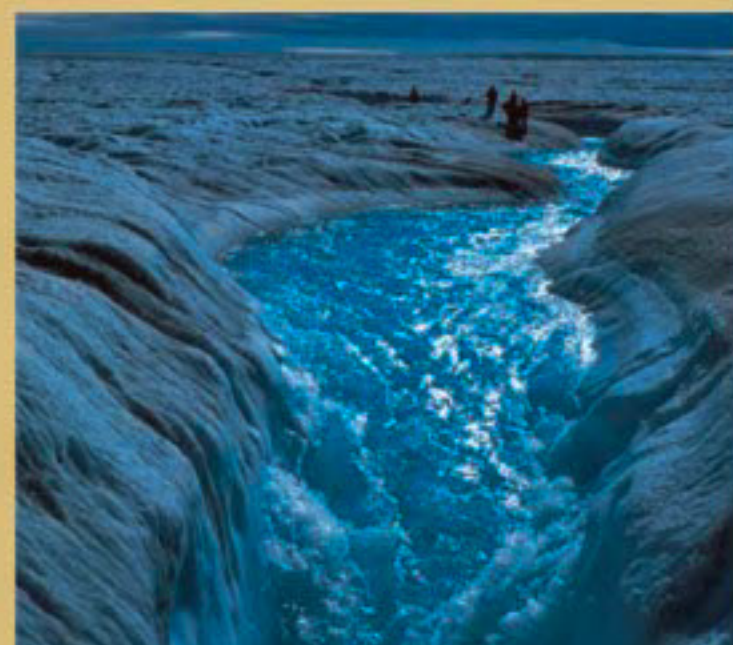
Melting of glaciers